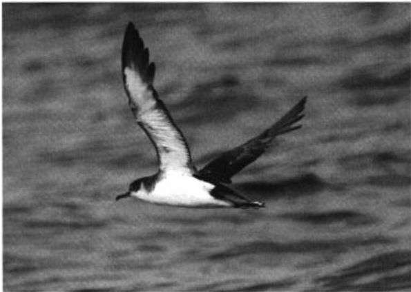
With over 20 Manx Shearwaters reported off Northern California in autumn 2006, one wonders whether the species increasing in the Region or just being more readily detected. This bird was smartly photographed in Monterey Bay on 22 October.