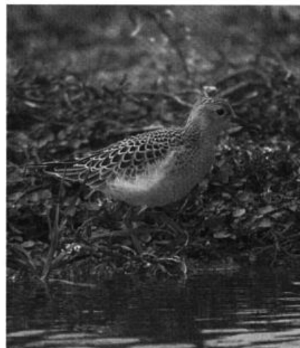
This Buff-breasted Sandpipers was present at the Pilarcitos Creek mouth, San Mateo County, California 6-14 (here 10) September 2006.