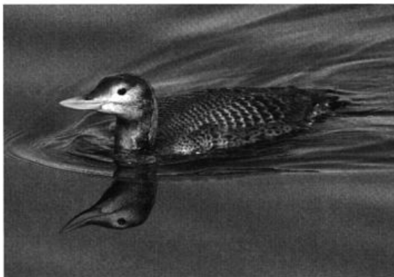
This cooperative immature Yellow-billed Loon was at Pescadero Creek, San Mateo County, California 18-27 (here 24) November 2006.