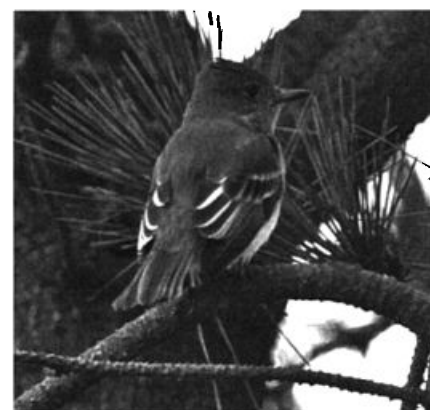
Great Crested Flycatcher, a rare transient to California, was found at Point Reyes National Seashore, Marin County 12 October 2006 (here).

Only 2 Summer Tanagers were reported this season, one banded on FI. and the other a rare Contra Costa find near Danville 14 Sep (PEG). The only Scarlet Tanager was on FI. 27 Oct (P.R.B.O.). Seven coastal Green-tailed Towhees were in S.F. (3), Monterey (2), and Santa Clara (2), 24 Sep–24 Oct. It was raining Spizella sparrows this fall. Eight American Tree Sparrows, 39 Brewer's, and 118