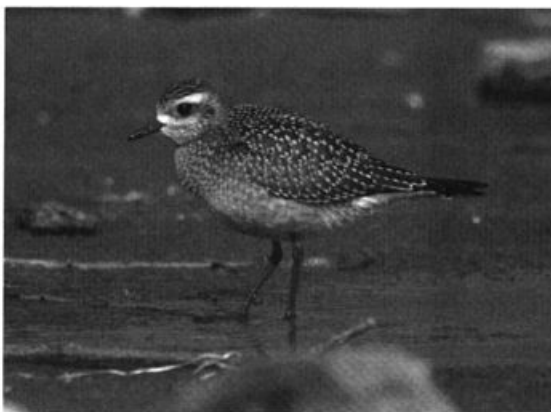
Eleven American Golden-Plovers, all juveniles, were reported in autumn 2006 in Northern California, including this bird present at Virgin Creek Beach in MacKerricher State Park, Mendocino County 1 (here) through 5 October 2006. Six of these birds were first detected in November, rather late.

phia Vireos were reported 5 Sep–15 Oct, though one at L. Merced, S.F. 14 Oct (†BFI, LLu, CLu) was the only one for which any details were received. Fourteen Red-eyed Vireos 5 Sep–10 Oct, including at least 7 from Hum-