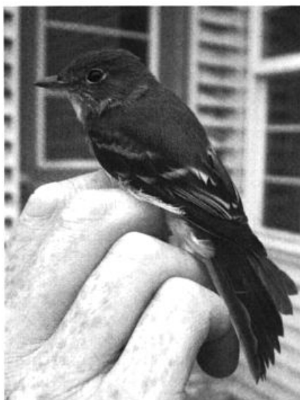
This Empidonax, thought to be an Alder Flycatcher, was present on Southeast Farallon Island, California on 8 (here) through 11 September 2006. If accepted by the California Bird Records Committee, it will represent just the fifth record for the state.