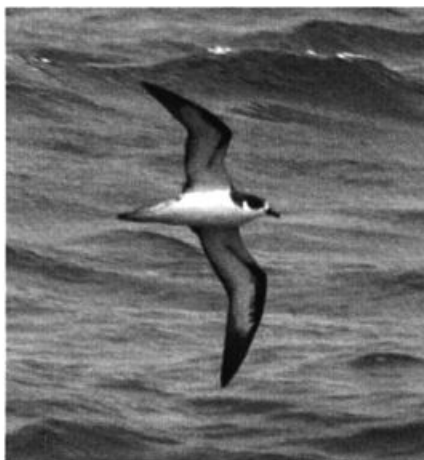
This Galapagos/Hawaiian Petrel put on a twenty-minute show as it circled the boat off Fort Bragg, Mendocino County, California 13 August 2006; the "Dark-rumped Petrel" (now considered two species) has been found increasingly frequently off California in recent years.

Greater Shearwater was on Monterey Bay in Santa Cruz and Monterey 15 Oct (ph. SNGH et al.), on the same trip with one of the Streaked Shearwaters! Buller's Shearwaters peaked at 1340 and 2750 on Monterey Bay, Monterey and Santa Cruz , 10 Sep and 7 Oct, respectively (ShJ), with single flocks estimat-