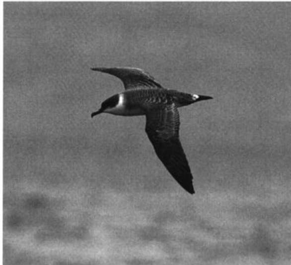
Yet another record of Greater Shearwater for California came from Monterey Bay 15 October 2006—the same day as birders documented a Streaked Shearwater nearby.