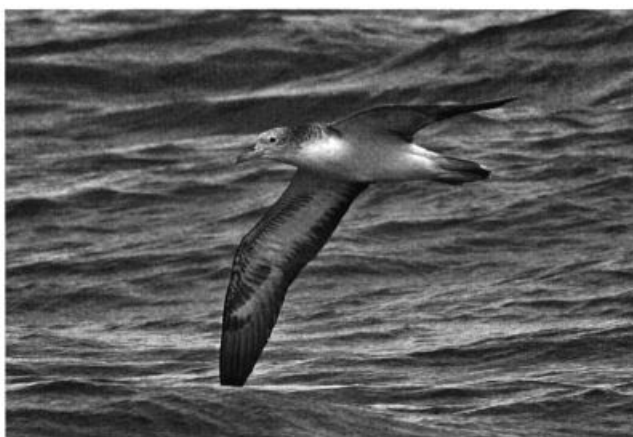
One of several recorded in fall 2006 off California, this Streaked Shearwater was photographed in Monterey Bay on 15 October; the species has been detected annually in the Region in recent years.