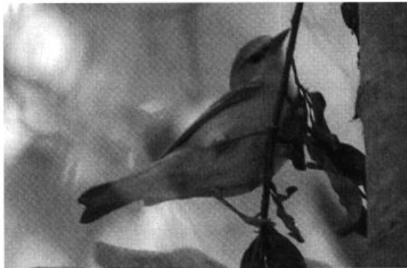
This Blue-winged Warbler, representing the Northern California Region's first fall record since 2001, was found near the Carmel River mouth in Monterey County 27 (here 28) October 2006. It remained through the period and over the winter.