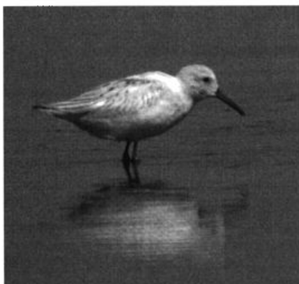
Reports of leucistic shorebirds are received occasionally, but seldom are they so nicely documented as this Western Sandpiper in Alviso, Santa Clara County, California 19 September 2006 (here); the bird remained here through 5 October.