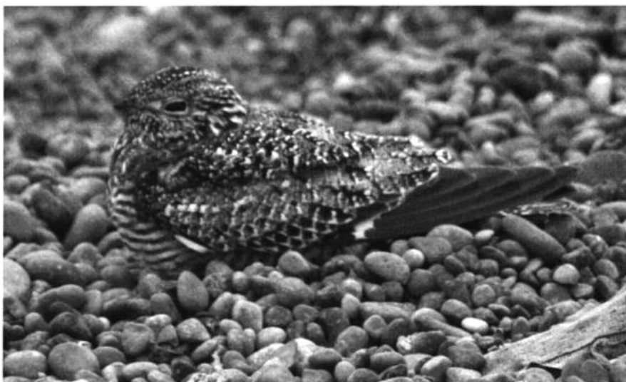
A long way from nearest breeding areas, this Common Nighthawk ventured out into the Bering Sea, where it managed to hang on at Gambell, Alaska late July through 15 (here 6) August 2006, a first for the Bering Sea.

group of 16 in Juneau 13 Aug (MS) was a good peak count for the Southeast, where they have been found over the past decade to be regular in low numbers, mostly in Aug. With few fall records away from their sw. coastal breeding areas, a lone Marbled Godwit offshore at Sitka 26 Sep (MLW, MET) was noteworthy. Two Red Knots on the slush ice at