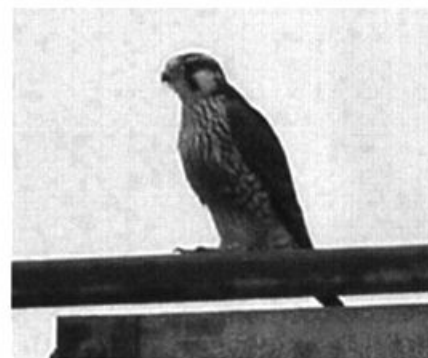
With recent increased coverage during migration on Shemya Island, Alaska, in the western Aleutian chain, Eurasian Hobby has been found to be regular there. This adult was observed 24 September (here) through 2 October 2006.

showing, with 2 different drakes in the Ketchikan area 18 Sep (RN) and 28 Nov+ (PR, ph. AWP), plus another in Juneau 29 Sep and again in Nov through at least the 20th (DM, ph. RA). These represent Ketchikan's 5th/6th records of this casual fall migrant usually located in s. Southeast. Eurasian Wigeons passed in average numbers at the usual Bering Sea–Aleutian sites, with a peak of 69 counted at Shemya I. 10 Oct (MS). Extralimital American Wigeons included one at Gambell 8 Sep (PEL), a Gambell first in autumn, and one on