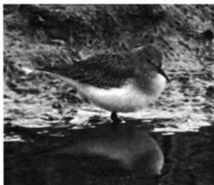
Temminck's Stint and Red Knot, though disparate in size, both show pale gray upperparts with dark shaft streaks and pale-edged coverts. This juvenile Temminck's was one of two that visited Shemya Island, Alaska 10-13 (here 6) September and very late on 1 October 2006.

ed remains casual in Alaska, mostly from the North Gulf in late summer. The only notable Buller's Shearwater report was a single off n. Tanaga I. 31 Aug (†TG), a first for Aleutian waters. Short-tailed Shearwaters peaked at 1,600,000 off Gambell 17 Sep (PEL, GHR), a