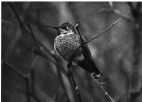
Known in Alaska from a handful of fall records, this Anna's Hummingbird wandered northward and westward to Ketchikan, where it made a living at feeders and Fuchsia flowers 26 August into December (here 22 November) 2006.