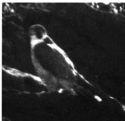
This very pale Peregrine Falcon, likely of the Nearctic subspecies tundrius , was found along the Attu Island beaches 20 September 2006, probably the first documented record for a subspecies other than pealei in the western Aleutian Islands.

ed Shearwaters were also found 6 & 26 Aug off se. Kodiak I. (JBA), where there have been several late-summer observations. Lone Flesh-footed Shearwaters were described from off Icy Cape 9 Aug (†MS) and in the w. North Gulf of Alaska sw. of the Shumagins 4 Sep (†TG). Still not substantiated for the Region by photograph or specimen, Flesh-foot-