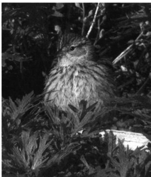
Two more Chipping Sparrows at Gambell, Alaska in fall 2006 (here 14 September) brings the autumn total there to a surprising 12 birds since 1998. This species breeds no closer than in southeastern and extreme eastern-central Alaska. All of these fall records have been of birds with remnant juvenal breast streaking, typical of many young, western Chippings but not shown by most mid-autumn juveniles in the East.

they are casual, with probable imm. Rufous Hummingbirds reported in Fairbanks (at least 4) 4 Aug–27 Sep (fide A.B.O.) and s. to Delta Jct. 17 Sep (fide SD). Another wandering Rufous made it to Kodiak 3 Sep (fide RAM), where the species is occasional. Following St. Lawrence I.'s first record from the spring, another Northern Flicker (of the Yellow-shafted group) darted around Gambell 7–14 Sep (LSa,