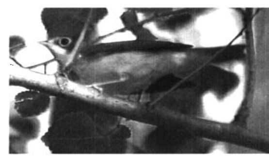
Making a single-day visit to Socorro, Socorro County 30 August 2006, this Canada Warbler provided New Mexico's tenth overall (and fourth verified) record.

(JB). Botteri's Sparrows away from the Animas Valley were one singing n. of Rodeo 11 Aug (DK) and 2 singing along Stateline Road w. of Rodeo 4-5 Aug (CGL). Clay-colored Sparrow was unusually prevalent in the east, e.g., 58 at Mt. Dora plus 21 at Clayton L. 3 Sep (CR); several were w. to Rodeo 2 Sep-31 Oct, including a high 12 on 8 Oct (ph. RW). A Field Sparrow was at Clayton L. 30 Sep (CR). A Baird's Sparrow at Wimberly Ranch, Otero Mesa 20 Sep (DG) furnished the lone report. A Fox Sparrow reached Los Lunas 1 Oct (CR). Two White-throated Sparrows were w. to Bluewater Cr., Cibola 25 Nov (CR). Providing a local first was a Harris's Sparrow in P.O. Canyon 23 Nov+ (CDL). A minimum of four or five pairs of Yellow-eyed Juncos were in the Burro Mts. in Aug, and breeding was documented (DG); dorsalis Gray-headed Junco pairs were likewise present and breeding there (DG). Historically scarce (or overlooked?) in New Mexico, Lapland Longspurs were reported at six Colfax sites 8-30 Nov (DC, JEP), including an unprecedented 200 at Springer L. 23 Nov (ph. DC); far w. was one in n. Hidalgo 13 Nov (ph. R. F. Shantz). Early were 2 McCown's Longspurs in Union 30 Sep (BN, CR) and 2 Chestnut-collareds near Cimarron 26 Sep (DC).