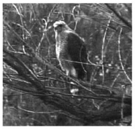
Historically considered irregular (at best) in New Mexico, Gray Hawk recently has staged a steady expansion into the state. This one photographed 11 August 2006 was one of several in the Animas Valley, Hildalgo County this season.

Doves n. of usual were 2 at Logan 12 Aug (CR) and singles at Santa Rosa 19 Sep (WW) and San Lorenzo 20 Aug (DB). Common Ground-Doves of note were a pair in Guadalupe Canyon 6 Aug (DK) and singles at R.S. 27 Aug (WW) and 10 Sep (SW) and Carlsbad 27 Aug (SW). A female Ruddy Ground-Dove was near Radium Springs 4-25