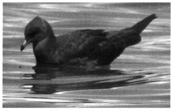
This immature Long-tailed Jaeger in the dark morph reached Sumner Lake, De-Baca County 25 August 2006 but was found dead there the following day (specimen to Museum of Southwestern Biology); it provided New Mexico's twelfth record.

(DH). Far s. of expected, 2 Clark's Nutcrackers were on Jack's Peak, Burro Mts. 12 Oct (DG). American Crows invaded the Mesilla Valley in Oct, where some 1500 were estimated 4 Nov (CGL) and over 4000 were reported 6 Nov (JD).