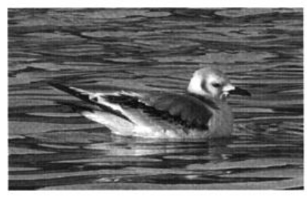
With about 18 New Mexican records, Black-legged Kittiwake is a rare treat in the state. This immature was at Bluewater Lake, Cibola County 25-27 (here 27) November 2006.