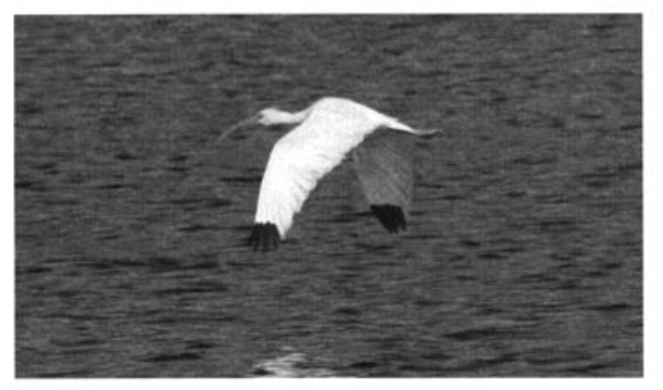
White Ibis is turning up in New Mexico with increasing frequency, with reports for six of the past eight years. This adult was north to French Lake, Colfax County 29 August through 5 (here 2) September 2006.

at E.B.L. 5 Nov (ph. CGL). Single Ruddy Turnstones were at Morgan L. 20-21 Aug (JR, AN) and Ruby Ranch n. of Las Vegas 18 Sep (WW). Noteworthy w. of the plains, well-documented Semipalmated Sandpipers were one to 2 at Sunland Park 26-31 Aug (ph. JNP) and one at Holloman L. 24 Aug (CGL). Latest Pectoral Sandpiper was one at Bosque 29 Oct (WH, CGL). Single Dunlins reached B.L.N.W.R. 23 Oct, Deming 27 Oct (LM), and Holloman L. 26-29 Nov (SW, CGL). Rarely well documented in New Mexico, single Short-billed Dowitchers were at Clovis 12 Sep (ph. JO) and Sunland Park 26 Aug (ph. JNP). A Red Phalarope was on a desert playa w. of Santa Teresa 24 Nov (JEP, MS, JZ).