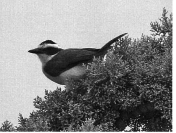
Great Kiskadees are known to wander away from their normal range, but this bird at Abilene, Taylor County, Texas, found 14 (here 17) September 2006, was unexpected so far to the northwest.