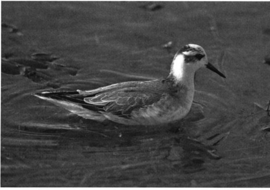
This cooperative Red Phalarope delighted many during its extended stay along the shore of Stillhouse Hollow Lake, Bell County, Texas 23 (here 29) October through 14 November 2006.

Scoters included one at Hornsby Bend, Travis 19 Oct (EC), one at Kirby L., Taylor 24 Oct (LP), and one at Braunig L., Bexar 24 Oct (MMS). Two White-winged Scoters visited Pat Cleburne L., Johnson 2-4 Nov (ph. JoS). White-winged Scoters were also found at separate Grayson locations 26 Nov, one at Randell L. and another in Sherman (WM). The lone Long-tailed Duck of the season was at Hagerman N.W.R., Grayson 23-25 Nov (LBa). A notably high count of 85 Hooded Mergansers was made in Longview, Harrison 9 Nov (DBr, MEd).