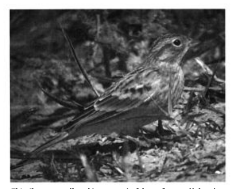
This Chestnut-collared Longspur in Adams County, Nebraska 24 September 2006 provides the first documented record for the eastern part of the state.

Nebraska. A Bullock's Oriole in Canadian , OK 17 Sep (JW) was easterly and tardy. The few Purple Finches reported arrived later than usual; noteworthy were singles as far w. as Scott , KS 5 Nov (T&SS); the only one reported in Nebraska was in Platte 23 Nov (MB). A Cassin's Finch was found in Morton , KS 22 Oct (SS). Quite rare was a Lesser Goldfinch in Scotts Bluff , NE 3 Sep (fide AK).