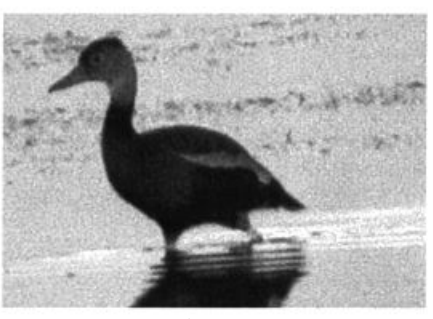
Furnishing the first record for North Dakota, this Black-bellied Whistling-Duck was at the Jamestown Sewage Lagoons 10-16 (here 12) September 2006.

A Black-bellied Whistling-Duck was photographed and seen by many at the Jamestown Sewage Lagoons, ND 10-16 Sep (SS); this represents the first record of the species for the state. A rare blue-morph Ross's Goose was at Long Lake N.W.R., ND 10 Nov (DNS). Rare in fall in the Dakotas, a Cinnamon Teal was in Grant, SD 12 Oct (BU). Unbanded, but probably an escapee, a Whitecheeked Pintail was shot by a hunter in Stutsman, ND 4 Nov (p.a., SC). Besting the previous state high of 2, a flock of 5 Harlequin Ducks was at the Fargo Lagoons, ND 22-24 Oct (p.a., DWR, CDE, REM). An average flight of Surf and White-winged Scoters included a nice peak of 12 Surf Scoters at Cooney Res., MT 5 Oct (BI). Black Scoters made a good showing in North Dakota, with six reports 8 Oct-10 Nov. They were noted in