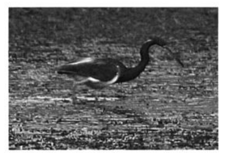
This Tricolored Heron was seen by many 21 (here) through 25 September 2006 at Lake Alice National Wildlife Refuge, North Dakota, just the eighth record for the state.