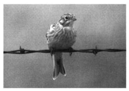
A good-sized flock of 125 Smith's Longspurs, including this one, was found in Renville County, North Dakota 6 October 2006 (here).