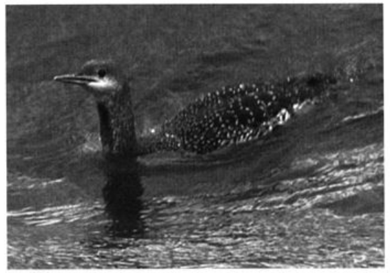
This Red-throated Loon at Lake Hefner, Oklahorna City 26 November 2006 (here) was a genuine rarity there, though Oklahorna has had regular records from Lake Tenkiller.

furnished Nebraska's 5th documented report Nebraska also posted a record showing of Surf Scoters this season, with 13 birds reported 22 Oct-16 Nov, including 6 at McConaughy 31 Oct (SJD, fide WRS). Other Surfs included singles in Cherokee, KS 7 Nov (DHe) and Tulsa 19 & 23 Oct and 4 Nov (BC, TC, and JWA, respectively). The only other scoters were Blacks, including a whopping 27 reported 15 Oct-28 Nov in Nebraska (fide WRS), among them a flock of 20 at Salt L., Lancaster 25 Oct ([G]); one and 2 birds were noted at two locations in Tulsa 12 & 20 Nov (TWA; TC). Also appearing in above-average numbers were Long-tailed Ducks, with at least 7 reported from Nebraska beginning 30 Oct in Lancaster (early, [G]) and singles in Blaine, OK 31 Oct (also early, shot by hunter, fide NW), in Sumner, KS 5 Nov (LHi), in Sedgwick, KS 5 Nov (PJ), in Osage, KS 11 Nov (MG, BAS), and at Salt Plains 11 Nov (TC). A Barrow's Golden-