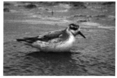
One of three Red Phalaropes seen in North Dakota during the season, this individual was at the Minot Sewage Lagoons 18 September 2006 (here).