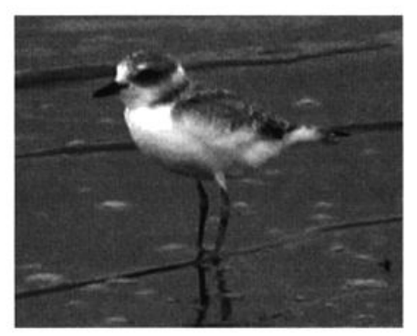
Furnishing the ninth record for North Dakota were two Snowy Plovers at Long Lake National Wildlife Refuge 11 August 2006 (here).

record for the state (p.a., REM, CDE). A possible 6th record for Montana, a Yellow-billed Loon was photographed in Billings 18-26 Nov (p.a., RV, GM).