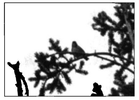
The highlight of the 2006 Alberta fall migration was the province's first Yellow-throated Warbler, present at Calgary on 9 and 10 (here) September 2006.

Longspur at Banff 31 Oct (JR). A Black-headed Grosbeak at Alonsa, MB early–17 Nov was record late (ph. HH). Rusty Blackbird is a species of concern, so good numbers reported from Manitoba's s. Interlake region, including 300+ at Grosse Isle 13 Oct, were encouraging (KG). A Common Redpoll was banded at Delta on the early date of 21 Aug (HdH). From mid-Oct+, good numbers of both redpoll species appeared in the s., in sharp con-