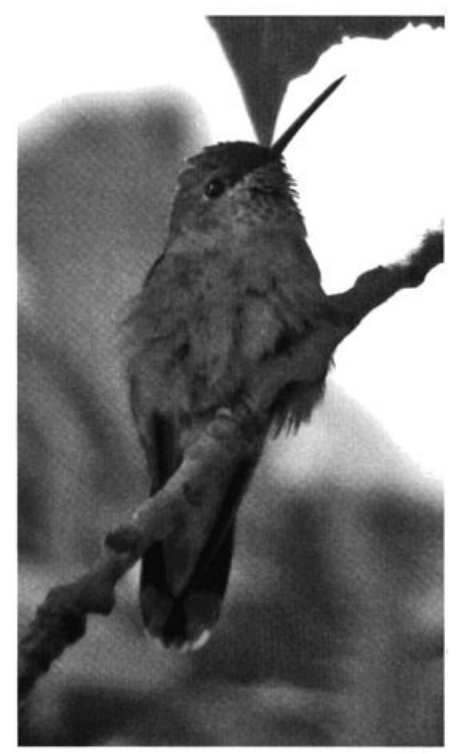
The first for North Dakota, if accepted, an apparent Broadtailed Hummingbird was present 3 (here) through 11 September 2006 in Kidder County.