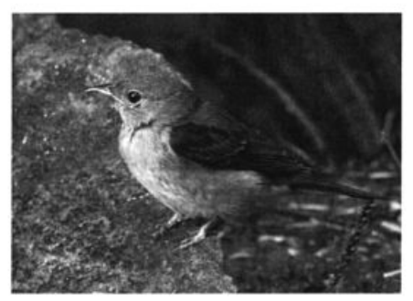
Montana had it sixteenth record of Scarlet Tanager with this individual in Fort Peck 18 September 2006 (here).