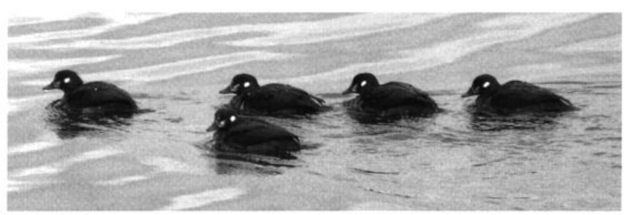
Five Harlequins Ducks at the Fargo, North Dakota Sewage Lagoons 22 (here) through 24 October 2006 provided a new state high count for this casual species.