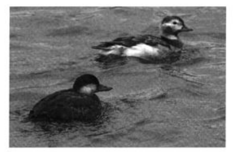
Both rare migrants in South Dakota, this Long-tailed Duck and Black Scoter were photographed 22 October 2006 in Pierre.