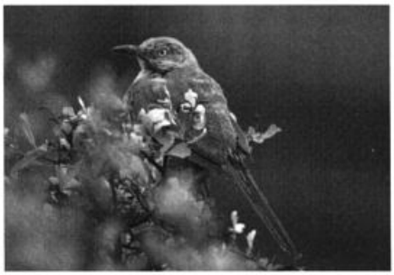
Furnishing a first record for Montana, and one of the northernmost anywhere, this Curve-billed Thrasher was near Roundup 8 (here 23) September 2006 through the end of November—bested this season only by a Curve-billed in Saskatchewan.