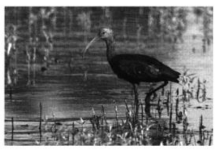
Providing a fourth inland Alabama record, this White-faced lbis was one of two visiting Eufaula National Wildlife Refuge, Barbour County 20 September 2006 (here).

Rare but regular in the T.V., 4 Laughing Gulls were reported from three sites (SWM,