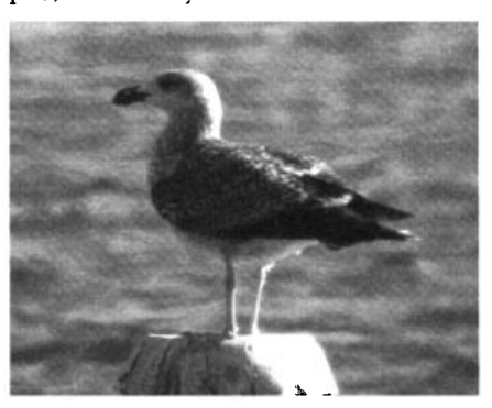
Earliest on record for inland Alabama, a first-year Great Black-backed Gull dominated the scene 7 October 2006 (here) at Guntersville, Marshall County.