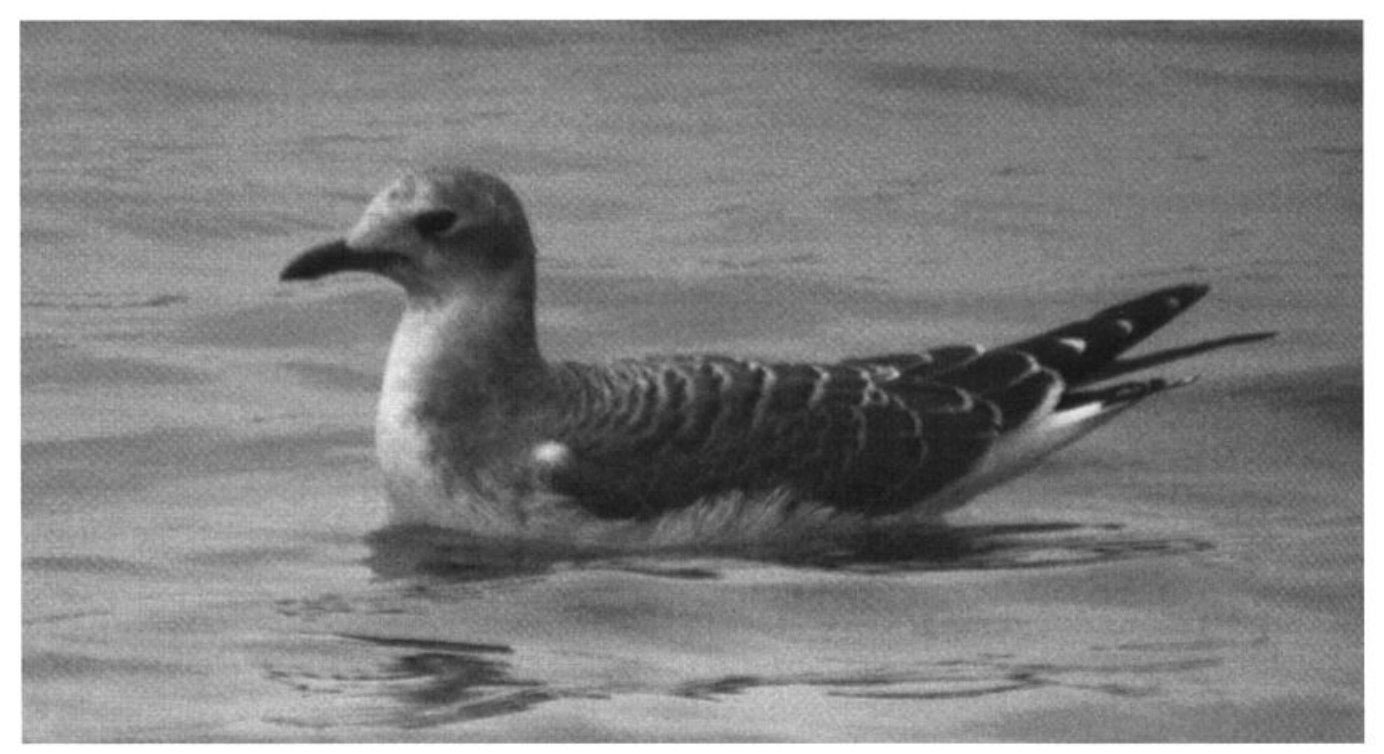
Finding a Sabine's Gull in a catfish pond in northeastern Mississippi certainly made for a memorable day's birding! This juvenile furnished the state's ninth record 1 September 2006 (here) in Chickasaw County.

Thrushes were at Ft. Morgan 3 Nov (RAD, LRD). At least 6 rare and elusive Sprague's Pipits were ferreted out of the grass at two sites in s. Baldwin , AL beginning 5 Nov (BS, m.ob.); another was found 21 Nov in Hancock , MS (p.a., NB).