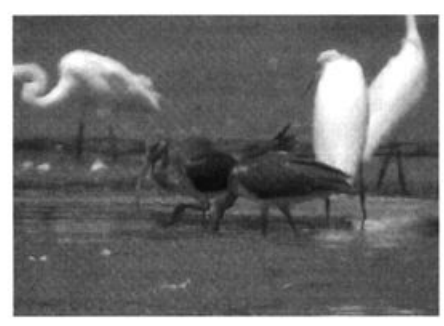
These two juvenile White Ibis were part of a concentration of waders in western Fulton County, Kentucky 9 August 2006; one lingered until 14 August.