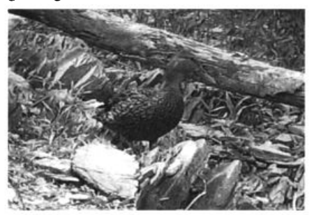
Mottled Ducks continue to be detected annually in the Tennessee & Kentucky Region; this one was at Douglas Lake, Sevier County, Tennessee 5 through 9 (here) September 2006.

An early-season count of 1000 Greater Whitefronted Geese at Sauerheber 28 Nov (MMr) was relatively impressive. Cackling Geese were reported from Shelby , TN 22 Nov (one; DPr, MTOS) and Britton Ford, Tennessee N.W.R., Henry , TN 24 Nov (6; MaG, ph. MT). Two early-season Mute Swans in Wayne , KY 19 Aug (RDn) and Oldham , KY 14 Sep (BW) may have been summering. The first of Sauerheber's wintering flock of Tundra Swans to be reported were 7 there 16 Nov (MMr). A Mottled Duck at Douglas L., Sevier , TN 5-9 Sep (†KDE, ph. JA, ph. DJ, m.ob.) added to the growing number of recent records for the Re-