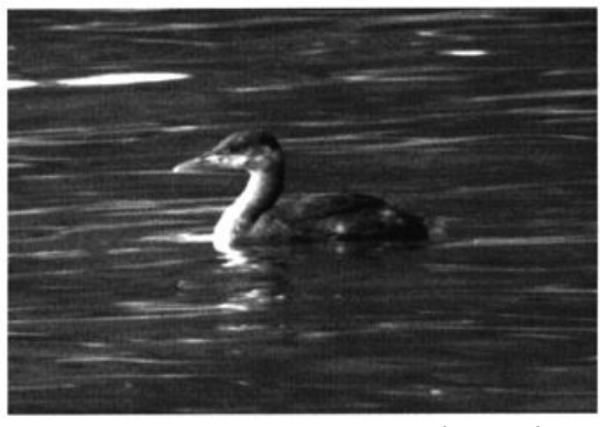
A small passage of Red-necked Grebes was noted in November 2006 in the Tennessee & Kentucky Region. This bird was present on Lake Cumberland, Pulaski County, Kentucky 4-24 (here 5) November.

Wood Storks were at Rankin late Jul-5 Sep (RK, MSl, DMi, m.ob.), Lake No. 9 on 9-13 Aug (ph. DR, RDn), n. Memphis 19 Aug (JRW, MT), and Shelby Forest, Shelby , TN 4 Sep (VR); 13 were at Memphis, TN 18 Aug (JRW).