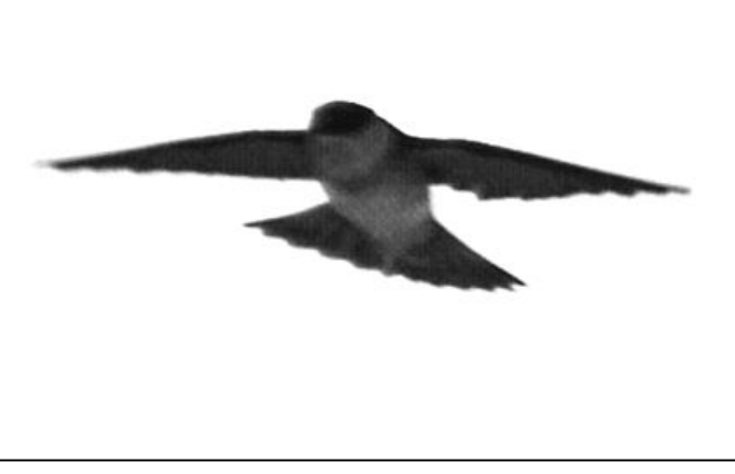
The Tennessee & Kentucky Region's long-expected first record for Cave Swallow was represented by two at the mouth of the Wolf River, Memphis, Tennessee 30 September 2006. These birds were associating with hundreds of Northern Rough-winged Swallows.