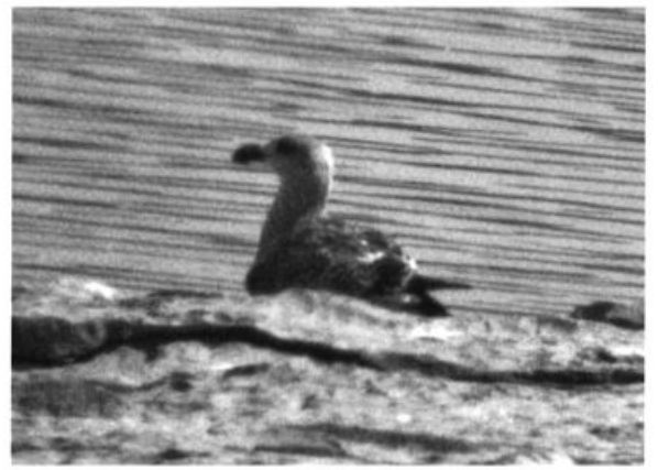
Great Black-backed Gulls continue to be quite rare in the Tennessee & Kentucky Region, especially outside of winter. This first-year bird was present at the Falls of the Ohio 6-9 (here 7) September 2006.