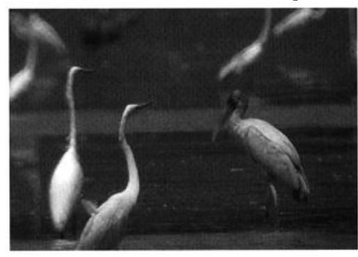
Wood Storks remain quite rare as far north as western Kentucky, where this immature was present 9 (here) through 13 August 2006.

Unusually late were single Greater Yellowlegs in Trigg, KY 24 Nov (BL) and Jefferson, KY 27 Nov (BW), and 2 Lesser Yellowlegs