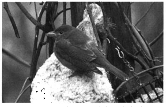
An unexpected visitor to a North Bay, Ontario feeder was this female Summer Tanager from 25 (here 30) November into early December 2006.

Ontario had 2 Northern Wheatears to add to this fall's widespread influx in e. North America. One frequented Lakehead University campus in Thunder Bay 6-9 Sep (KWa, m.ob.) and the other was at Nepean, Ottawa