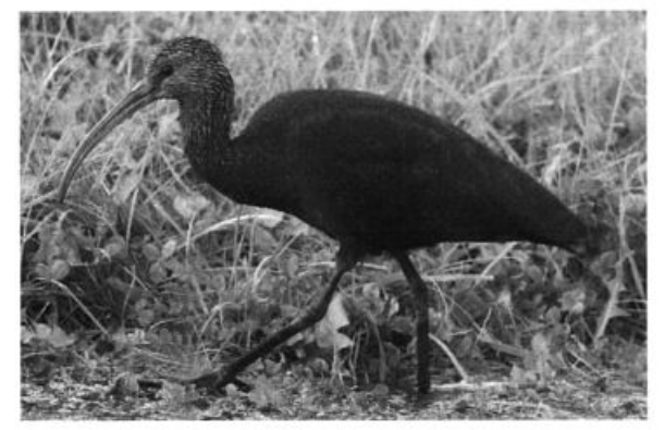
This adult White-faced lbis, the first for the Long Point Bird Observatory area, was with 10 Glossy lbis in wet fields near Big Creek, Ontario 2 (here) and 3 October 2006.

Rapids and Shirley's Bay 13 Nov (TFMB, BDL), with at least 104 remaining the following day (BDL). A Pacific Loon was off P. E. Pt. 5 Nov (K.E.N.), and one was at the Tip of Pt. Pelee 18 Nov (BRH), the latter the 5th fall record for the P.P.B.A. A flyby Yellow-billed Loon at Thunder Cape 14 Oct (JMW, T.C.B.O.) would constitute a first record for Thunder Bay if documented and accepted.