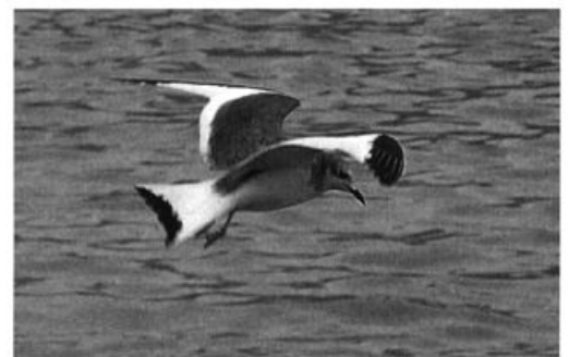
One of a few Sabine's Gulls reported on Lake Erie in autumn 2006, this juvenile visited Port Stanley, Ontario harbor 17 October 2006.

It was a good fall for jaeger-watchers. Presqu'ile P.P. had an ad. Pomarine Jaeger 3 Sep (RIS), possibly the same bird seen at