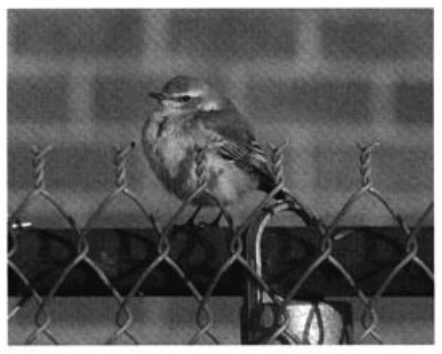
Part of a wider influx to northeastern North America was this immature Northern Wheatear seen in Thunder Bay, Ontario on 10 September 2006.

pressive 21 Lesser Black-backed Gulls, mostly ads., were at the Deschênes Rapids on the Ottawa R. 21 Sep (BDL). A total of 16 juv. Sabine's Gulls flew by V.W.B. 24 Aug–11 Sep (RZD, m.ob), with a peak of 7 on 11 Sep (MWJ, RZD et al.); a juv. Sabine's Gull was well photographed at Port Stanley 13 Oct (SR, DJB). Black-legged Kittiwakes were well reported: V.W.B. birders tallied 13 juvs. 25 Aug–11 Nov; at least 3 frequented the Niagara R. 29 Oct–26 Nov, including 2 ads. 18 Nov