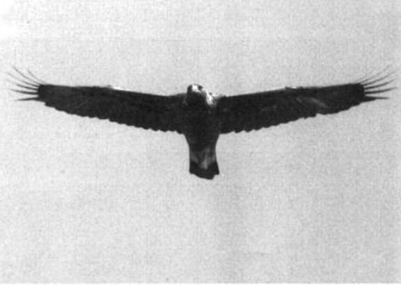
A record 15 Golden Eagles tallied at Hawk Cliff Hawkwatch, Port Stanley, Ontario on 28 October 2006 included this magnificent immature.

A flock of 11 Plegadis ibis found in wet fields near Big Creek, Norfolk 2-3 Oct (SW)