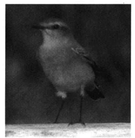
This Northern Wheatear at Honeymoon Island State Park, Florida was a one-day wonder 25 September 2006.

River Park 14 Sep (BH). Wilson's Warblers were numerous, with 15 singles reported 22 Aug-28 Nov. The very rare Canada Warbler was observed at six locations, more than is usual: Turkey Creek Sanctuary 8 Sep (DBa), John Chesnut Park 11-12 Sep (TA, LA), Phipp's Park, Leon 15 Sep (AW, JW), Sugden Park, Collier 17-18 Sep (AM, DSu), Cape Florida 12 Oct (MDa, RD), and L. Munson 17 Oct (AW). Six Yellow-breasted Chats were found at Frog Pond W.M.A., a recent wintering site 11 Nov (MBe). There were 20 Summer Tanagers at Ft. De Soto 12 Oct (BAh) and