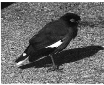
This Common Myna at Seven Springs, Florida 28 October 2006 represented the northernmost pioneer reported along the Gulf coast.

Two Black-headed Grosbeaks (ad. male, juv. male) were a surprise at Ft. Walton Beach W.T.P. 28 Sep (†TPh), and another graced Gainesville 23-24 Oct (J&JM). Lake Apopka N.S.R.A. supported 72 Blue Grosbeaks 1 Oct