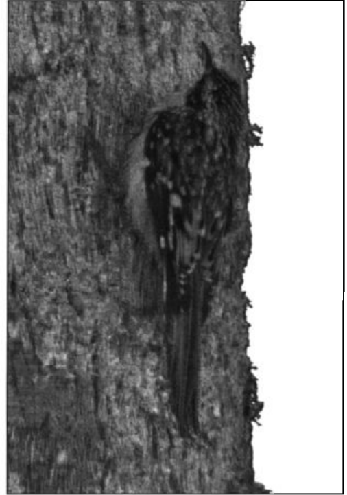
This Brown Creeper at Cocoa Beach 3 November 2006 furnished the southernmost verifiable record in Florida.

Furnishing a first for the Gulf coast and for the cen. pen., a Thick-billed Vireo was a oneday wonder at Ft. De Soto 12 Oct (JG, BAh; acc. FO.S.R.C.). Surprisingly, there were eight reports of Bell's Vireos beginning 14 Sep, all singles except for 2 at Frog Pond W.M.A. 28 Oct+ (RT, TM). One Bell's was banded at Tomoka S.P., Volusia 5 Oct (MWi, ph.). Extremely early was the Blue-headed Vireo at Gainesville 26 Aug (†BoC). Very rare but annual in Florida, a Warbling Vireo was spied at Ft. De Soto 30 Oct (LA). More than usual, there were 13 reports of 16 Philadelphia Vireos statewide 20 Sep–18 Oct, with duos at Ft. De Soto 27 Sep (BAh) and St. George Island