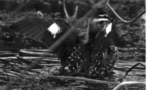
This female-plumaged Masked Duck at Viera Wetlands, Florida was first found 6 (here 12) November 2006 and remained through the month. A second bird in similar plumage was discovered at the site in December but may have been present earlier.

(MBe, ABa), and a Ruff 9 & 26 Aug (BH, ABa). The (low) high count of Red Knots in the state was just 450 (22 banded) at Little Estero Critical Wildlife Area, Lee 5 Sep (CE). Two Sanderlings at Lake City 30 Aug–14 Sep (PBu) were casual inland, while 2 White-rumped Sandpipers at Merritt I. N.W.R., Volusia 10 Nov were late (TD). Very rare in the state, Baird's Sandpipers enlivened Santa Rosa 1. 24 Aug and 8 Sep (BD), Lake City 10 Sep (2; PBu), and Lake Apopka N.S.R.A. 10 Sep and 4 Oct (HR). Seven reports of 13 Buffbreasted Sandpipers ranged from Santa Rosa I. to Viera, with duos at Lake City 24 Aug–14