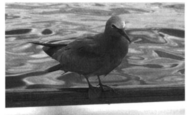
Two boaters in Tampa Bay, Florida were surprised when this Brown Noddy landed on their skiff and preened for 30 minutes on 30 November 2006.

20+ Monk Parakeets at South Daytona, Volusia 20 Nov (MBo) and 12 Blue-crowned Parakeets at Sebastian Inlet 25 Nov (ABa). There were 7 Black-billed Cuckoos 18 Aug–29 Sep, all singles in the pen. Late were Yellow-billed