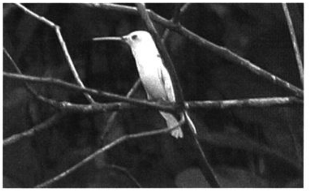
This leucistic hummingbird of unknown species was photographed in Amelia County, Virginia 1 August 2006.

Among the birds displaced by—or at least those having their migration interrupted by— Ernesto were many shorebirds, though many of the species that were seen in unexpected locations do have some history of showing up in unusual spots, and so it is difficult to determine whether they were related to the storm's passage. A flock of 54 Black-bellied Plovers at Capeville, Northampton 21 Aug was notable for including 6 juvs. so early (ESB). A Piping Plover at Assateague L., Worcester , MD 11 Nov was late (JLS). Two American Avocets at Shirley Plantation, Charles City 10 Aug (AB) and one at a farm pond on Rte. 642, Au gusta 2 Oct (ph. Steve Thornhill) stand out