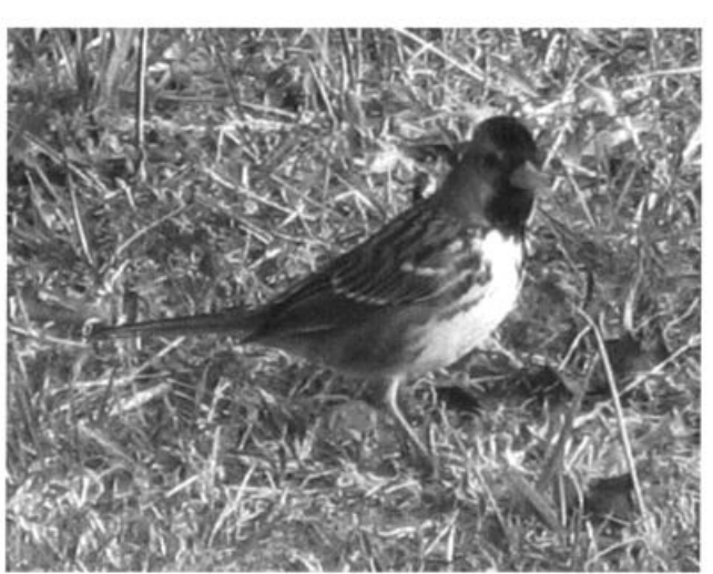
Until 2003, Harris's Sparrow was known in Virginia only from sixteen records from the northern and western reaches of the state; this adult at Kiptopeke State Park, Northampton County 6 November 2006 was the third of its species for this coastal locale, the other two having been found in November 2003.