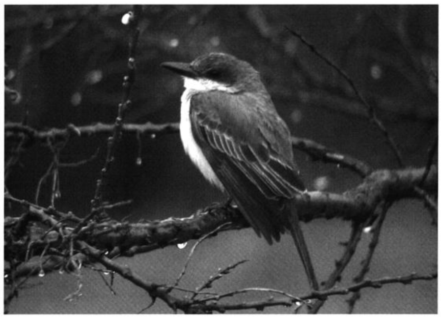
This adult Gray Kingbird, the first for Québec, spent 5-30 (here 9) November 2006 at L'Anse-à-Beaufils, near the tip of the Gaspé Peninsula. This individual fed mainly on the fruits of the Seabuckthorn ( Hippophae rhamnoides ).

per North Shore, the highest concentrations were attained farther ne. late in the season, with a daily maximum of 5 at Sept-Îles 11 Nov (BD, CC).