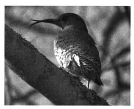
Aside from its crossed bill, this Northern Flicker in Dartmouth, Nova Scotia (here 3 November 2006) appeared to be otherwise healthy and normal.

(fide JWi). Single Western Tanagers were at Newcombe, Lunenburg, NS 28 Nov (fide JAH) and Irish Cove, NS 25-30 Nov (Barbara Cash). There were 6 Clay-colored Sparrows in Nova Scotia 1 Oct-7 Nov (fide DM). In was an average fall for Lark Sparrow, with 2 in Newfoundland and 8 in Nova Scotia. Vagrant Grasshopper Sparrows in Newfoundland were singles at Cappahayden 11 Nov (BMt) and Cape Race 18 Nov (JWe). Surprisingly, there were no Blue Grosbeaks reported in Nova Scotia, but there was one near Cape Race, NL 30 Sep (JWe). Making up for the lack, a male Painted Bunting was photographed at a feeder at Grand Étang, C.B.1. 25 Nov-Dec (Melissa Welsh et al.). Dickcissel is often taken for granted in autumn, and the species is thus probably under-reported; however, totals of 12 in Newfoundland, 6 in St. Pierre et Miquelon, and 15 in Nova Scotia indicate an above-average fall flight. A meadowlark, presumably an