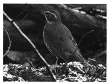
This Redwing, about the tenth for Newfoundland, joined a flock of American Robins in a St. John's suburb on 25 November 2006 (here)—the first in an unprecedented flurry of sightings of the species in the St. John's area during December and January.

Eastern, was a rarity at Cape Race, NL 21 Oct (BMt et al.). Single Yellow-headed Blackbirds were at Cherry Hill Beach, NS 27 Aug (fide DM) and Seal I., NS 27 Aug (BMy). The finch world was lackluster, with no significant numbers of any species reported.