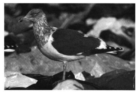
The adult Slaty-backed Gull found at the landfill in St. John's, Newfoundland on 26 November 2006 was the fourth individual of the species to occur at this location in 2006. There were no prior records for the province. This bird remained for the winter.

na Wrens in Nova Scotia was about average for the season.