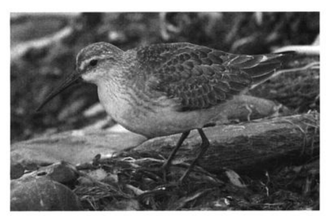
Juvenile Curlew Sandpipers are far less numerous than adults in North America. This juvenile present at Long Beach, near Cape Race, Newfoundland 7-21 (here 15) October 2006 gave observers plenty of time to catch up with this less-than-annual provincial rarity.

It was a fairly good fall for Baird's Sandpipers, with at least 17 reported in Nova Scotia and a half-dozen in Newfoundland, including a late one 5 Nov at St. Shotts (KK et al.). A juv. Curlew Sandpiper was at Long Beach near Cape Race, NL 7-21 Oct (BMt et al.). Two Stilt Sandpipers at St. Paul's Inlet, NL 24 Aug (JCl et al.) and one at Renews, NL 9 Sep (DB et al.)