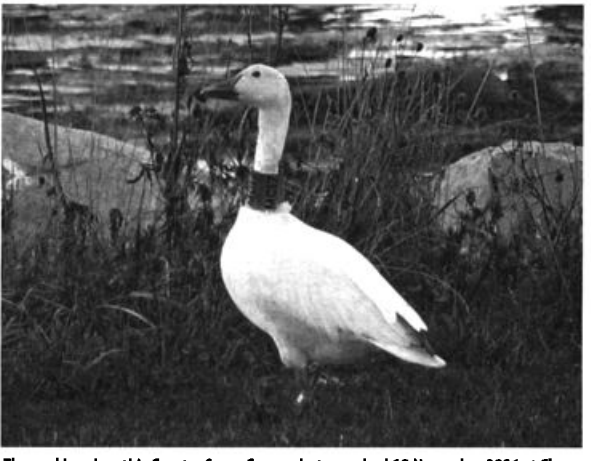
The neckband on this Greater Snow Goose photographed 10 November 2006 at Clam Harbor, Nova Scotia indicates that it was banded 9 August 2005 as an adult female on Bylot Island, off northern Baffin Island, Nunavut.

A nonbirder photographed an unfamiliar bird in St. John's cove on 5 Aug; photographs shown to the birding community a month later revealed Newfoundland's and North America's 3rd record of Eurasian Oystercatcher (fide BMt). The previous records were Tors Cove, Avalon Pen. 22-25 May 1994 and Eastport, Bonavista Pen. 4 Apr-2 May 1999. Eleven American Oystercatchers were at C.S.I., NS 31 Aug (JN, MN). The only report of an American Avocet was at Cole Harbour, NS 6-8 Oct (Sterling Levy). Record-high numbers of Hudsonian Godwits were noted e. of the main migration route through the Bay of Fundy and w. Nova Scotia: Miguelon, SPM had a record count of 14 on 1 Oct (RE, LJ), while Newfoundland had high single location counts of 10 at Eddies Cove East 10 Sep (JG) and 6 at St. Shotts 3 Oct (BMt). A Marbled Godwit at Grand Barachois, SPM 10-12 Oct