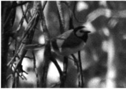
This Hooded Warbler was photographed 12 June 2006 at Mesa de Guacamayas, providing the first record for the state of Chihuahua.