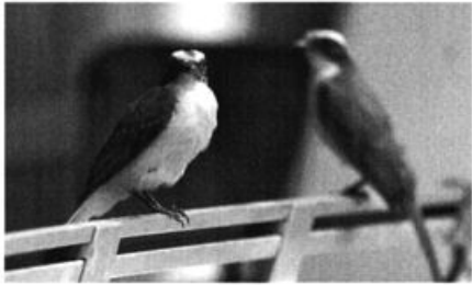
This pair of Social Flycatchers nested in Hualahuis, Nuevo León (here 3 July 2006), a first documented record for the state.

coastal species, Black Catbird—which had been reported as individuals or pairs scattered throughout the interior of Yucatan—has been documented in recent years in small nesting colonies in the spring and summer. One such site is San Antonio Chel, where 15–20 active nests in close proximity were observed 22 Jun,