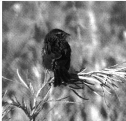
Sierra Madre Sparrow was recently (2004) rediscovered in the state of Durango, Mexico after a 50-year absence. This bird was located in Bajío de Aguinaldos, Durango 14 July 2006, about 40 km from the nearest prior record; it likely represents a dispersant from the known population or a still-undiscovered one.

Erratum: The White-collared Swifts reported at UNAM Botanical Gardens, D.F. 30 Apr in the spring 2006 issue were in fact White-naped Swifts.