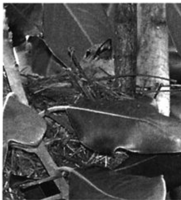
This Blue-gray Tanager was one of a nesting pair found this summer in Hualahuises, Nuevo León (here 3 July 2006), apparently the first documented record for the state.

surprising that 6 were still around 25 Jun at a ranch near San Felipe, Ría Lagartos Biosphere Reserve, Yuc. (RM). Ocellated Turkey is showing up more often on land dedicated to ecotourism projects where protection is assured; several were heard and 2 seen at San Antonio Chel, Hunucmá, Yuc. during the last two weeks of Jul (AM). And, as the number of