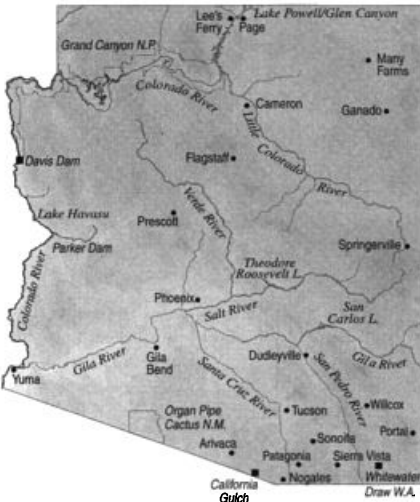
Mark M. Stevenson (Non-Passerines) Gary H. Rosenberg (Passerines)

D rought conditions persisted through a hot and dry June. Observers noted a related lack of nesting success among pine-oak woodland species. Relief arrived with ample rainfall in July, setting the stage for a productive "second spring." Highlights included nesting Ruddy Ground-Doves and an influx of Aztec Thrushes.