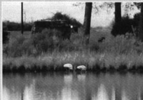
At Wake, Middlesex County, Virginia, two immature Wood Storks took up residence in a backyard pond 4-29 (here date unknown) July 2006.