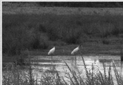
These immature Wood Storks frequented Luck Stone's New Kent Wetlands Mitigation Bank in New Kent County, Virginia 8-24 (here date unknown) July 2006.