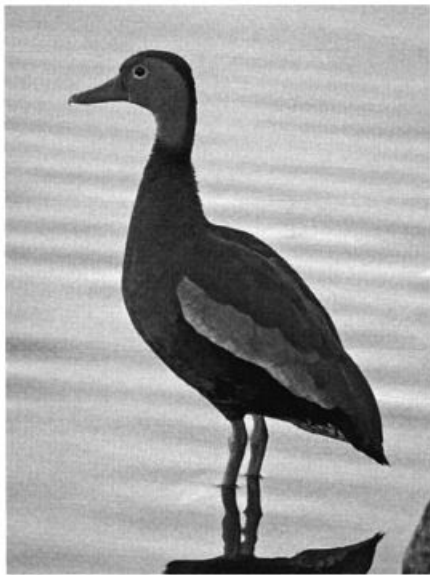
Part of a widespread flight out of core range, this Black-bellied Whistling-Duck graced Montgomery County, Maryland 6 June 2006.