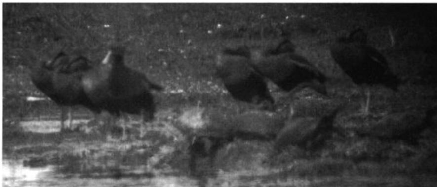
A flock of seven Black-bellied Whistling-Ducks roamed Back Bay National Wildlife Refuge, Virginia Beach, Virginia 21-27 (here 27) July 2006.

Good numbers of Lesser Black-backed Gulls continue to summer along the beach at