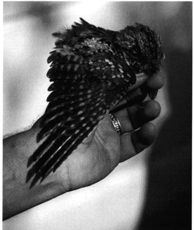
This road-killed Puerto Rican Nightjar was an unfortunate find near Sabana Grande, Puerto Rico 5 April 2006; the species is listed as critically endangered, though it has been found nesting (or presumably nesting) in several new locations in recent years, including the locale where this male was found.