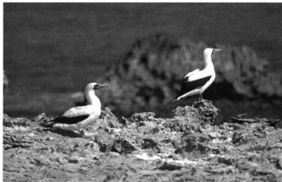
Masked Boobies do not presently breed in the Bahamas, but these two at Booby Rock, Mayaguana 19 March 2006 suggest that breeding may occur in the near future.

A Chimney Swift at Harrold & Wilson Ponds N.P. 13 May was the first for the park (TH, LH, KHL, WP, PD). On St. Lucia, 3 Short-tailed Swifts were in the Des Cartiers area 12 Apr (AJ). Two Blue-headed Hummingbirds were seen on Fond Baron Rd., Martinique 14 Apr (AJ). A Northern Flicker was at Devonshire Church, Bermuda 1 Mar (SD).