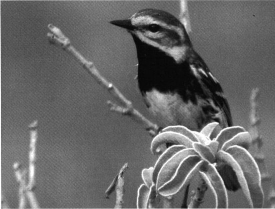
Black-throated Green Warbler, uncommon at best in the Lesser Antilles, was detected at Petite-Terre Nature Reserve 5 May 2006 (here).

da, had a Yellow-bellied Seedeater 8 Apr (AJ).