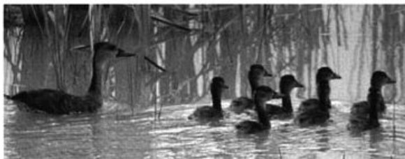
Recent breeding of West Indian Whistling-Ducks on Eleuthera, Bahamas was confirmed by photographs of this family at Rock Sound Airport 9 March 2006.

Plovers were at Grape Bay, Bermuda 1 May (PW). On 5 May, Flamingo Cay, Ragged Is., Bahamas held 3 Semipalmated and 2 Wilson's Plovers and 15 Semipalmated Sandpipers (PF). Piping Plover was last noted on Green Turtle Cay, Bahamas 10 May (EB). Single Black-necked Stilts in Bermuda were seen at North Pond 23 Mar–5 Apr (GB) and Spittal Pond 22–27 May (PA). On 22 Mar, a wintering Eurasian Whimbrel was among several shorebirds at Guadeloupe (AL). A Whimbrel (of the American subspecies hudsonicus ) was seen 17 Mar at Vieques, Puerto Rico, where more than 300 Stilt Sandpipers were noted at Laguna Navio 19 Mar (DG, BM). On Antigua, 60 Stilt Sandpipers were found at McKinnon Salt Pond 19 Apr (AJ). A smattering of spring shorebirds arrived in Bermuda in May, including a Stilt Sandpiper at North Pond 6 May and single White-rumped Sandpipers at North Pond and Jubilee Rd. 21 May (AD).