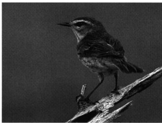
This Palm Warbler (of the nominate subspecies), the fifth for Guadeloupe, was at Petite-Terre Nature Reserve 15-18 (here 15) May 2006.