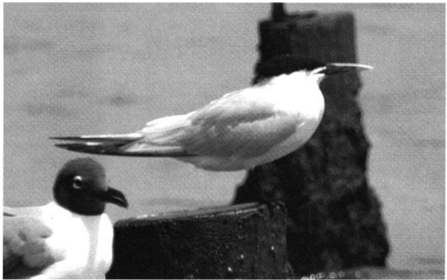
This intergrade Sandwich Tern × Cayenne Tern, photographed 30 March 2006 at the ferry terminal in Fajardo, Puerto Rico, is typical of birds that nest not far away in the Virgin Islands (see North American Birds 57: 566–572).

At Dominica, a distant White-tailed Tropicbird was seen from the s. end of the island 16 Apr (AJ); 15 were at Little Harbour, Abaco, Bahamas 10–12 Mar (PD, LL, LH); and up to 25 courted around the cliffs of Guajataca, Puerto Rico in late Mar (ESB, GLA). Four Red-billed Tropicbirds were noted breeding at The Highlands, Barbuda 20 Apr (AJ). Three ad. Masked Boobies were photographed on Booby Rock off nw. Mayaguana, Bahamas 19 Mar (OG, ph. TH), and a subad. was seen 16 km off Great Guana Cay, Abaco, Bahamas 20 Apr (EB). At Pointe des Châteaux, Guadeloupe, there were 3 Masked Boobies 14 May (AL, AM, AR). A Great Cormorant that wintered in Great Sound, Bermuda was last seen