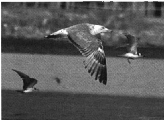
Herring Gulls in Central America are usually first-winter birds and are rarely recorded outside of winter. Although this second-summer gull at the mouth of the Río Jiboa, found on the late date of 23 May 2006, was initially identified as a Herring Gull, it has generated much debate on the Internet. It may be a hybrid (note dark eye and large bill), and Herring Gull may not even have been one of the parents.

Two Double-striped Thick-knees in a fallow harvested rice field 5 km s. of Matapalo between Quepos and Dominical 23 Apr (PM), following close on the heels of the first record