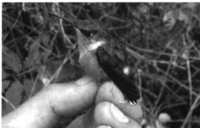
Sparkling-tailed Hummingbirds are rarely reported and even more rarely captured in El Salvador. This female was mist-netted at Montecristo National Park on 23 March 2006.

Rufous-vented Ground-Cuckoos put on a show for birders and other visitors to the Rainforest Aerial Tram bordering Braulio Carrillo N.P. 29 Mar–8 Apr (m.ob.). Up to 3 were seen together regularly from the tram, the loading platform, the parking lot, the coffee shop, and even right outside the plate glass windows of the gift shop. A persistent army ant swarm in the area around the tram enticed these rare and seldom-seen birds into the open. At least 3 Bare-shanked Screech-Owls heard calling and one seen at 1600 m about 15 km nw. of Hato Chamí 4 Mar (WA, GA) provided the first report from e. Chiriquí . Although considered rare in Honduras, Crested Owls were noted to be fairly common this spring in Pico Bonito N.P., Atlántida up to 900 m (DA). Anderson either heard or saw an individual on about 70% of visits into forested areas between dusk and dawn. To the southwest, Crested Owls were recorded on at least three territories in humid broadleaf forest 5 km nw. of R. Amarillo, a first record for Copán , 2 May (v.r. KE).