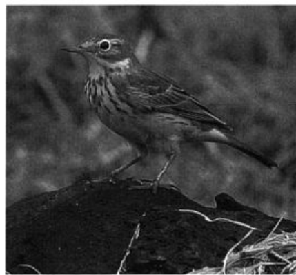
An American Pipit, only the third recorded in Costa Rica, was observed on the beach at Wafer Bay, Cocos Island from 1 (here) through 4 May 2006; it was located by a birding tour group visiting the island.

ra de los Cuchumatanes, 2 km s. of Páquix, Huehuetenango (ph. TJ). Grayish Saltator, first reported for Panama in 2003, now appears to be fairly common around Changuinola in Bocas del Toro . One was seen on a side road off the main road between Changuinola and Guabito 21 Mar, and another was heard at a different location along the main road the same day (KK, RM). Several were seen and heard at various localities around Changuinola 14–18 Apr (RM, DM, KK). Another isolated rainforest species found in humid