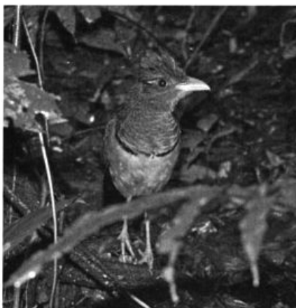
From 29 March (here) until 8 April 2006, a persistent army ant swarm at the Rainforest Aerial Tram adjacent to Braulio Carrillo National Park in Costa Rica enticed as many as three Rufous-vented Ground-Cuckoos at a time into the open, where they could easily be observed from the loading platform, the parking lot, the coffee shop, and even from the plate glass windows of the gift shop. The species is rarely observed in the open.

A Gray Catbird that approached and circled a boat well out to sea en route from Cocos I. 5 May (KEa et al.) and then headed north-