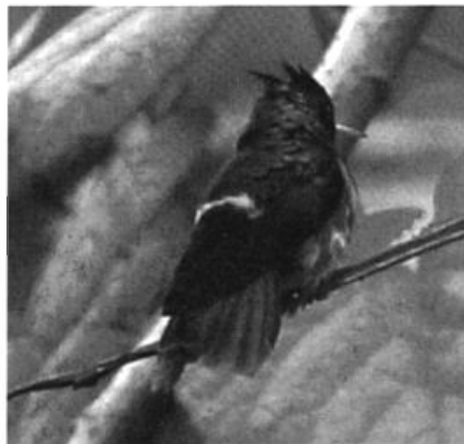
A pocket of rainforest and associated coffee plantations in the Río Amarillo valley in the Department of Copán in western Honduras was discovered to host isolated populations of nearly 20 bird species this spring. The Black-crested Coquette (male, 2 May 2006) is an example of one of these species.

from the Caribbean lowlands last fall (published in the journal Zeledonia ), were considerably farther s. on the Pacific coastal plain of Costa Rica than previously reported—apparently the first ever recorded s. of Jaco. Suitable habitat for this species exists all along the Pacific coast down into Panamá, leaving open the possibility of an incipient southerly range expansion. A Northern Jacana seen on the Chagres R. about 3 km upstream from Gamboa, Canal Area 16 May (GA) represented the