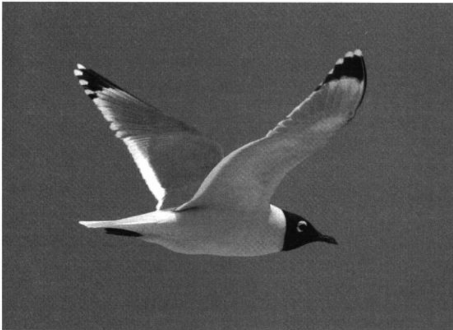
At Estero San José del Cabo, Baja California Sur, this adult Franklin's Gull was one of three or four reported in the general area on 19 May 2006.