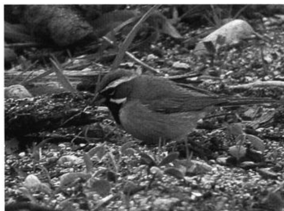
This Black-throated Sparrow was photographed 28 April 2006 at Gibson's, on the Sunshine Coast of British Columbia.