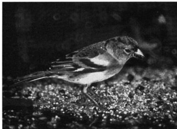
Continuing from the winter season, this Brambling remained at Duncan, British Columbia through at least 18 March 2006 (here 28 January); it was the sixth for the Victoria vicinity.