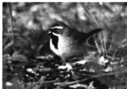
Alberta's second Black-throated Sparrow visited a Bears paw yard 28 and 29 May (here) 2006. It appeared following four days of weather disturbances moving up to the province from the American Southwest.

was rare (B&HSc). Calgary, AB hosted a smorgasbord of rare gulls: an Iceland Gull 29-30 Mar (RW, m.ob.), a Lesser Black-backed Gull 28-30 Mar (RB, RS), a Slaty-backed Gull 28-30 Mar (BCI, ET, MM, m.ob.), a Western Gull 4 Apr (potentially a Regional first) (TK, m.ob., ph.), and a Glaucous-winged Gull 8 May (RW). Elsewhere, a Lesser Black-backed Gull was at Wascana 6-12 Apr (BLU, m.ob.), a possible Herring Gull x Glaucous-winged Gull hybrid was at the PR 227 dump in s. Manitoba 17 May (PT, RKo, ph.), and a Glaucous-winged Gull was at Edmonton, AB 1