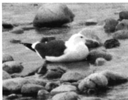
In a season that saw many rare gulls in Alberta, this Western Gull at Calgary on 4 April 2006 may have been the rarest. The identification was based on the overall heavy build, the heavy bill, dark eyes, large domed head, and drooping "skirt." If accepted, it would be a first for the Prairie Provinces.