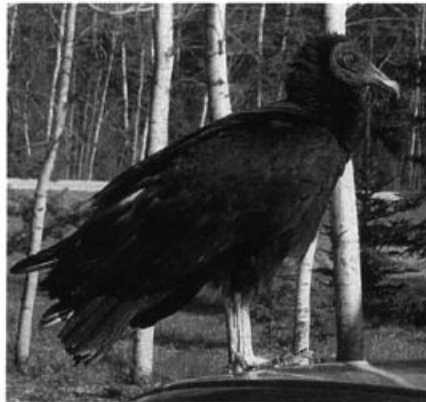
This Black Vulture, photographed at Wanless, in western-central Manitoba, 11 May 2006, furnished a first record for the province.

Snow and Ross's Geese were almost completely absent in se. Manitoba, reflecting a major westward shift in their migration path during the past few years. Up to 5 Trumpeter Swans were in the Pinawa, MB vicinity 6-30 May (PT, m.ob.). There were 12+ reports of Eurasian Wigeon in Alberta, involving 16 birds, 24 Mar-10 May (TK, DK, m.ob.). Farther e., 3 were at Wascana 5 Apr (SW, BE) and one near Regina 12 Apr (GK), while a Eurasian Wigeon × American Wigeon hybrid was near Stavely, AB 29 Apr (TK). A Common Loon at Gull L., MB 4 Apr was very early (AE, PF, RN, JP). A Great Egret strayed to Wascana 11 Apr (JC, m.ob.). Manitoba hosted 5 Snowy Egrets, including a northerly bird near The Pas 25 May (BPi, EB, ph.). A Little Blue Heron was at Whitewater 31 May (KD), and Cattle Egret numbers at this hotspot had climbed to 47 by 25 May (AC, LdM, RKO). Notable at Ft.