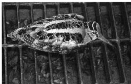
This American Woodcock at Redcliff, near Medicine Hat, Alberta 7 April 2006, was nearly 1000 kilometers west of its normal range. Representing the first confirmed record for the province, it departed when a television cameraman prodded it to see if it was alive!