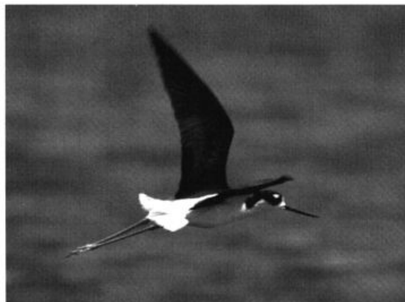
This male Black-necked Stilt was first found on 23 (here 26) May 2006 at White-water Lake, Manitoba. On 24 May, a female was discovered on a nearby nest, which later produced at least three young. This represents the first confirmed breeding of the species in the province.