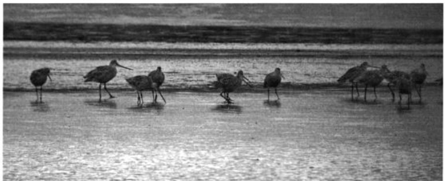
These Marbled Godwits were part of a flock of 20 in southeastern Muhlenberg County, Kentucky 21 April 2006—a new record high count for the state.