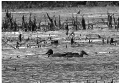
This pair of Cinnamon Teal was present in Henderson County, Kentucky 8 (here) through 10 April 2006.