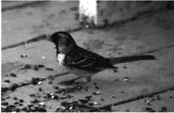
This adult Harris's Sparrow, one of four in the Tennessee & Kentucky region in spring 2006, was present in Bledsoe County, Tennessee 22 (here 27) April through 1 May 2006.