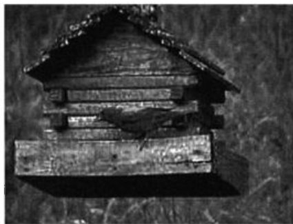
This male Painted Bunting in Cumberland County, Kentucky 26 May 2006 provided the state with only its second photographically documented record.

both early. A Worm-eating Warbler in Lyon 5 Apr (JBe, PB et al.) and a Louisiana Waterthrush in Calloway 16 Mar (HC) both represented new early arrival dates for Kentucky. Golden-winged Warblers put in a better-than-average showing in Kentucky for the first time in several years. A male Black-throated Blue Warbler at Reelfoot L., Lake, TN 5 May (NM) was unusual for the far w. portion of the Region. Connecticut Warblers passed through in average numbers; Mourning Warblers were reported in numbers much higher than average from e. Tennessee. A Summer Tanager in Nashville, TN 7 Apr (JaA) tied the early date for the local area; a Scarlet Tanager