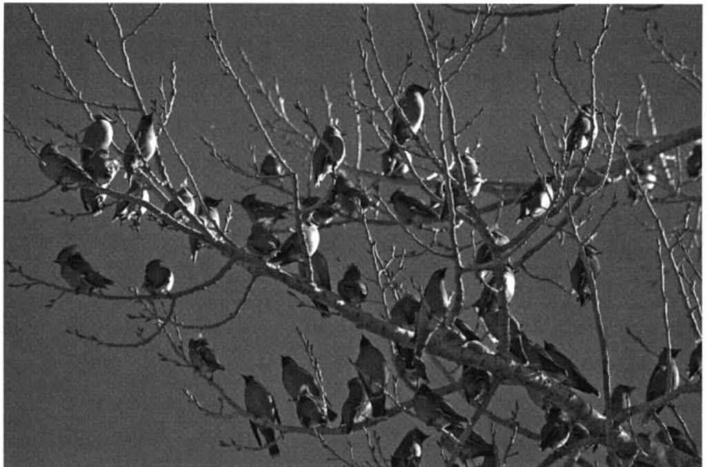
Large flocks of Bohemian Waxwings were observed in the northern portion of the Great Basin in late winter. This flock containing approximately 300 birds remained at Rye Patch Reservoir, Pershing County, Nevada for much of the season (here 7 February 2006).

were in short supply this winter. Twelve Least Sandpipers were an unusual find on the Carson City C.B.C., Carson, NV 18 Dec (GS et al.). Up to 4 Dunlins were observed 2 Jan at the H.B.V.P. (JBr), with at least 2 remaining throughout the season. An ad. Mew Gull made a rare Utah appearance 17-20 Dec at the Orem Sewage Treatment Ponds, Utah (KCh, ph. JK). Thayer's Gulls were reported 15 Dec–15 Feb from four Utah counties (Box Elder, Davis, Cache, and Salt Lake). A Lesser Black-backed Gull was located 15-19 Dec at the Bountiful Landfill, Davis, UT (CN, TA et al.). Glaucous-winged Gulls were reported from three Utah locations: 16 Dec–6 Jan at the Bountiful Landfill (JBi, BH et al.); 21 Jan–15 Feb at Farmington Bay W.M.A., Davis (BS, TA); and 28 Jan at the Logan Landfill, Cache (J&KE). Glaucous Gulls also made a strong showing this winter in Utah, with singles at the Bountiful Landfill 16 Dec–4 Feb (JBi, BH ph. TA et al.), Salt Creek W.M.A., Box Elder 5