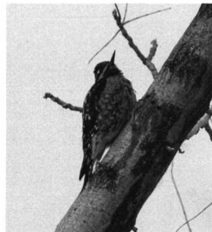
In Colorado, Cañon City was again a hotspot for wintering sapsuckers, with representatives of three species found, including this female Red-naped Sapsucker, here 18 December 2005.