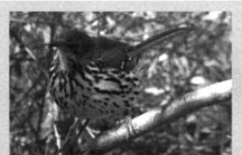
Forty-three thrashers of three Toxostoma species were found in Colorado in winter 2005-2006, among them this Long-billed Thrasher, the state's third, at Chico Basin Ranch 14 January through (here) 22 February 2006.