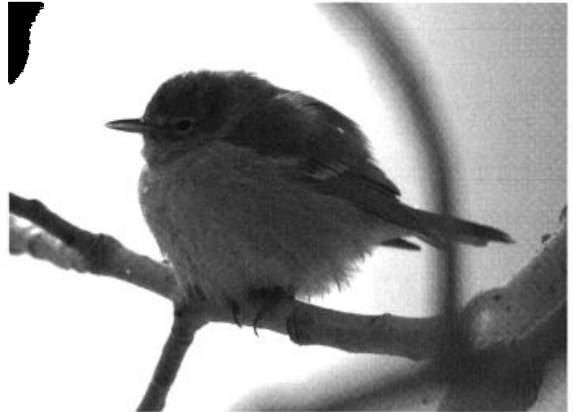
One of a remarkable four Pine Warblers reported in Colorado this winter, this bird frequented a feeder in Fort Collins, Larimer County throughout the winter (here 17 December 2005).