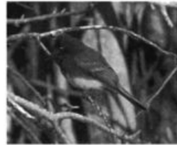
Providing a third winter record for Colorado was this Black Phoebe along the Arkansas River in Pueblo, Pueblo County on 11 December 2005 (here); it remained into March 2006.

likely, more birders are becoming comfortable with identifying them, as we received 15 reports of 38 individuals. All three scoters were found this winter: single Surfs in Fremont and Pueblo and single White-wingeds in Boulder and Douglas in Dec, when still somewhat expected, with a rarer Black 3-4 Dec at Chatfield (JK, m.ob.). The surprise, though, was an unseasonal White-winged