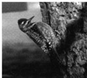
Minimally 14 Yellow-bellied Sapsuckers, a high count, were detected in Colorado in winter 2005-2006; this one was photographed 18 December 2005 at Cañon City, Fremont County.