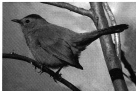
Part of Colorado's unprecedented mimid show this winter was this Gray Catbird (here 31 January 2006) that wintered at the Chico Basin Ranch, one of eight found in the Colorado & Wyoming region over the season.

the plains. A Carolina Wren at the Lamar Community College first found 12 Aug was joined by another for the winter (DAL); other singles were found at Valmont Res. 21 Jan (TF) and at Two Buttes S.W.A., Baca 22 Jan (BKP, MP). Reports of Winter Wrens were fairly numerous this winter and were highlighted by three reports of "Western" Winter Wrens, which are thought to be quite rare in Colorado (most winter records are of "Eastern" Winter Wrens): Colorado City 29 Jan–2 Feb (DS), Cañon City 18 Dec (CLW, TL), and Ft. Collins, Larimer 23–25 Mar, the latter a bird that was thought to have wintered (TL). A Blue-gray Gnatcatcher 18 Dec at Sundance,