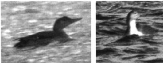
A species now found almost annually in Colorado, this Yellow-billed Loon was photographed at Pueblo Reservoir, Pueblo County on 4 December 2005.

Yet another season of above-normal temperatures in the Region created many opportunities to document the general northward shift in the winter ranges of several species and to find unusual winterers as well. Precipitation ranged from above average in Wyoming and Colorado's northern mountains to below average in Colorado's southern mountains and eastern plains, lead-