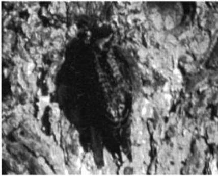
In a fine winter for sapsuckers in Colorado, five Red-naped Sapsuckers were located, including this male at Trinidad, Las Animas County 21 January 2006.