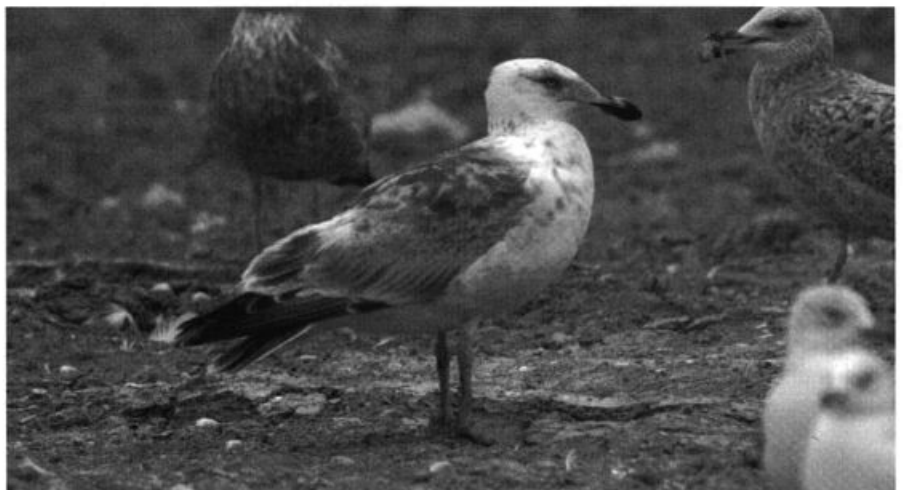
This second-winter Slaty-backed Gull made a one-day appearance at a private landfill near Houston, Texas on 22 February 2006. It provided the fourth record for the state and the first record of a bird not in adult (or near-adult) plumage.