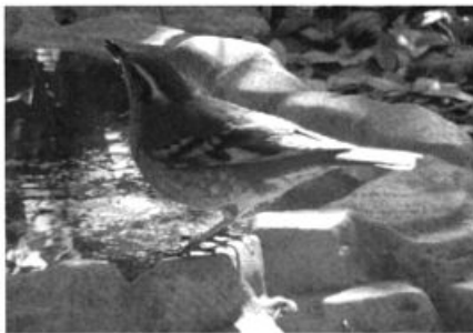
Varied Thrushes made a good showing in Texas this season, including this female at Kerrville from 8 January (here) through 1 March 2006. This bird was a sporadic visitor to a backyard water feature and provided the first record for the Edwards Plateau.

Sabine Woods , Jefferson 5 & 14 Jan (ScG, SM). A Whip-poor-will flushed at Freeport , Brazoria 18 Dec (MA) provided one of very few winter records there. Several Chaetura swifts on coastal C.B.C.s went unidentified; Vaux's has yet to be documented in the state. One or 2 Buff-bellied Hummingbirds visited feeders in Austin through mid-Jan (SR, BiB, MaC). Large numbers of Ruby-throated Hummingbirds apparently wintered on the U.T.C., highlighted by 8 on the Freeport C.B.C. (CB). A male from the fall remained in Washington through the winter (JRe). For the 2nd winter, a female Black-chinned Hummingbird re-