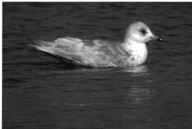
This second-winter Kumlien's Iceland Gull at the Hammond Marina, Indiana 7 January 2006 was notable in having very light primaries, more like those of nominate glaucoideus.