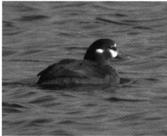
Harlequin Ducks are rare in the Illinois & Indiana region away from Lake Michigan. This female was photographed 21 December 2005 on inland Lake Decatur, Illinois, where the photographer had found it 17 December 2005 during the local Christmas Bird Count. The bird remained through 25 February 2006.