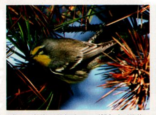
Perhaps part of California's "Madrean" summer and fall, four Grace's Warblers were found on Point Loma, San Diego County, in November 2005 (here 5 November).