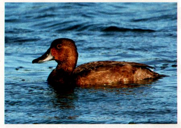
Three Canvasbacks accompanied this Redhead at the Kuilima Sewage Treatment Plant in Kahuku on O'ahu Island on 29 October 2005 (here); both species are rare in Hawaii.