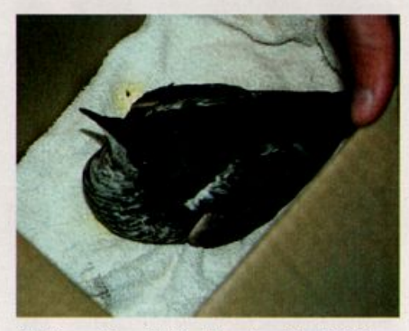
Alberta's second Long-billed Murrelet was found along the highway between Hinton and Jasper National Park on or before 8 August 2005 and was turned in at the park gate. The finder is unknown, as is the fate of the bird.