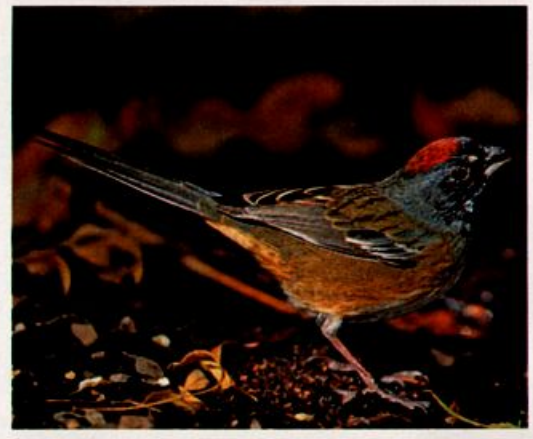
A combination seldom reported, this apparent hybrid Green-tailed Towhee × Spotted Towhee was in Ash Canyon, Arizona 26-27 (here 26) November 2005.