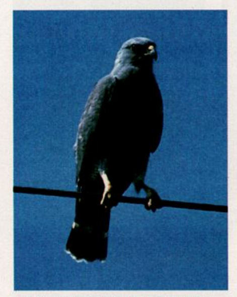
This Gray Hawk in Wichita, Kansas 20-30 (here 20) October 2005 represents the northernmost confirmed record of the species in North America.