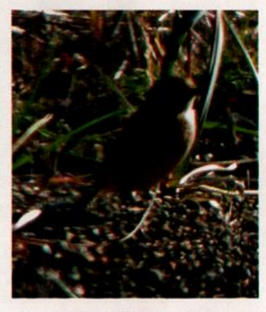
This stejnegeri-type Stonechat at Gambell, St. Lawrence Island, Alaska 6 September 2005 was the first documented there in fall and just the state's fourth autumn record.