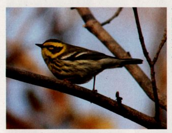
Three Townsend's Warblers were present in St. John's, Newfoundland in autumn 2005 (here 19 November): all twelve records of the species in the province fall are from November-December.