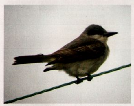
Providing the first record for Indiana, this Gray Kingbird was found in southern LaPorte County on 5 November 2005 (here).