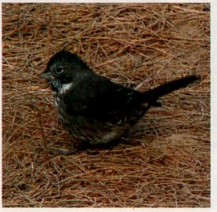
Slate-colored Fox Sparrow winters regularly in the mountains of northern Baja California but is seldom seen along the coast. This migrant was near the beach at San Quintín on 9 October 2005.