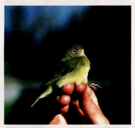
Idaho's newest banding station at Camas National Wildlife Refuge captured this immature female Connecticut Warbler on 30 August 2005, a state first. Remarkably, this banding crew netted another immature Connecticut 15 days later.