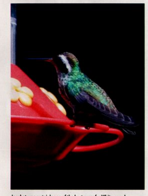
In what was certainly one of the best years for White-eared Hummingbirds in the Southwest, several made extralimital appearances, the most eccentric of which was this one in Hamburg township, Livingston County, Michigan 18-20 (here 19) August 2005.