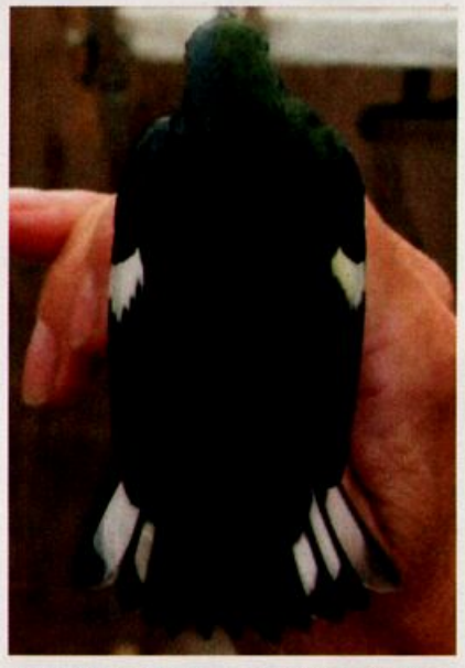
This Black-throated Blue Warbler showed greenish female-like plumage on its right side but typical male plumage on its left; it appears to be a bilateral gynandromorph, a very rare aberration but reported at least twice previously in this species. It was captured and banded 20 September 2005 at the Dolly Sods Banding Station, West Virginia.