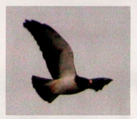
Completely unexpected in Michigan, this adult light-morph Shorttailed Hawk was photographed at Whitefish Point, Chippewa County 20 November 2005, the second and final day of its stay at this legendary location.