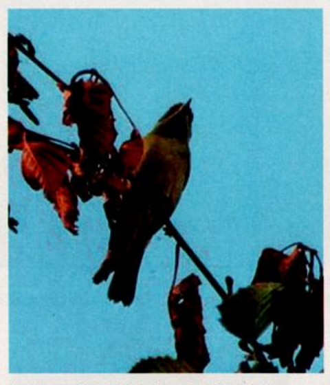
This Lawrence's Warbler, found in Boise's Barber Park on 21 October 2005 by the photographer, was a first for Idaho and also a first for the Pacific Northwest. The Gem State has just one report each for Bluewinged and Golden-winged Warblers!