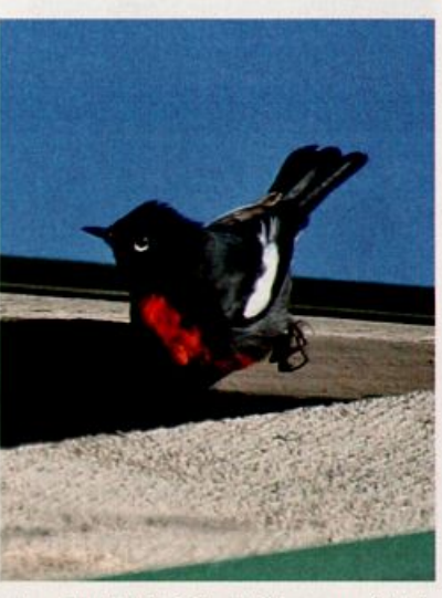
The warbier highlight of Colorado's fall season was a Painted Redstart that visited a residence near New Castle 16 through 18 (here) November 2005. The bird gleaned frozen and dormant insects from the eaves of a house.