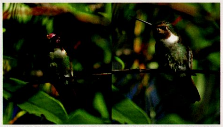
A first for South Dakota, and one of six hummingbird species recorded in the state in 2005, this Costa's Hummingbird delighted birders 9-17 (here 12) September in the Black Hills in Lawrence County.