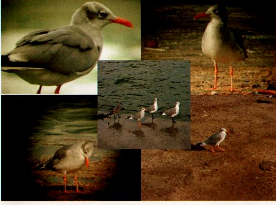
An unusual gull at Ría Lagartos, Yucatan, Mexico 19 September 2005 (here) and later was determined to be a Laughing Gull with orange bill and legs. A similar bird was noted in Lee County, Florida 30 September 2005.