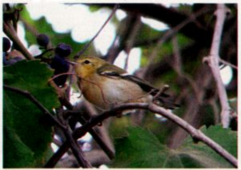
The Baja California Peninsula's fifth Bay-breasted Warbler was this firstyear female at El Rosario, Baja California on 9 October 2005. The faint blush of color on this bird's flank was difficult to perceive in the field.