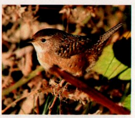
This Sedge Wren, a first for British Columbia, was a remarkable find at Cecil Green Park, Vancouver 29 October 2005.