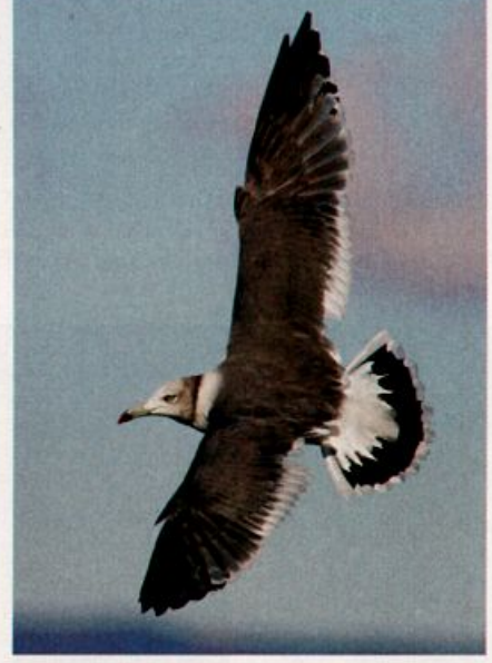
Present from 18 (here 21) October through 10 November 2005, this adult Black-tailed Gull was Vermont's first. It was very cooperative, eventually perceiving birders as a cue for feeding.