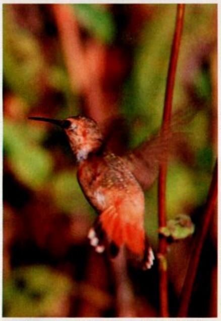
Virginia's second record of Allen's Hummingbird was furnished by this immature male at Cape Charles 25 October (here 3 November) through 30 December 2005.