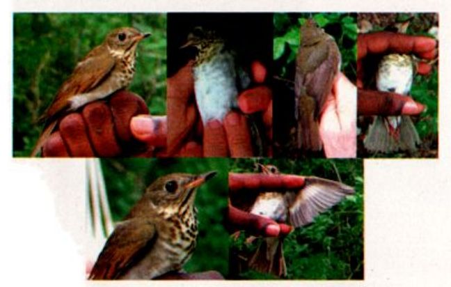
This Bicknell's Thrush was banded by the Kirtland's Warbler Training and Research Project 28 October 2005 near Rock Sound, Eleuthera, Bahamas. It furnished the second or third confirmed record for this species in the Bahamas.