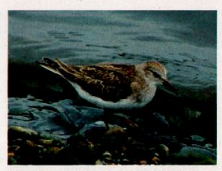
There are few records of Temminck's Stint in the New World away from the Bering Sea islands and only one south of Alaska: a juvenile near Vancouver, British Columbia in September 1982. This individual was present at Ocean Shores, Grays Harbor County, Washington 9 (here) through 13 November 2005.