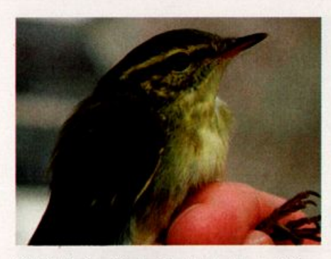
Off the California coast, Southeast Farallon Island has recorded single Dusky and Lanceolated Warblers in past autumn seasons, so this Arctic Warbler, banded 27 September 2005, was almost an expected island first; it furnishes the third record for northern California.