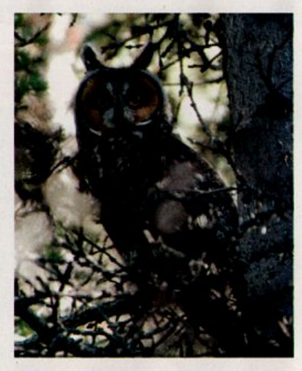
Two Long-eared Owls, part of a remarkable extralimital breeding record, lingered near their nest site at Sulphur Lake in southwestern Yukon Territories until at least 21 September 2005, when this bird was photographed. Unfortunately, one was taken by a Northern Goshawk the next day.