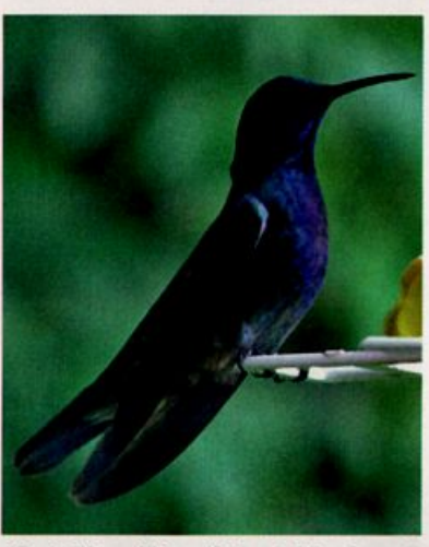
A first for Ohio was this Green Violet-ear in Holmes County 15 and (here) 16 August 2005.