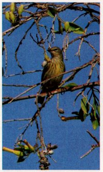
This first-year female Cape May Warbler was one of several eastern warblers found in the small town of Bahía Asunción, Baja California Sur, Mexico on 6 October 2005.