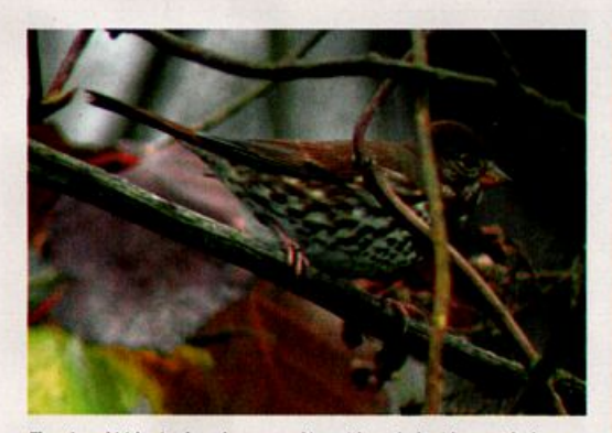
The crisp whitish wing bars, heavy streaking without dusky sides, streaked back, and lack of bright red tones mark this bird as a potential altivagans Fox Sparrow (near Monroe, Washington, 20 November 2005). This taxon has been placed with both the Red and the Slate-colored Fox Sparrow group (and often closely resembles zaboria Red Fox). It is thought to winter mainly in California, but there have been several fall and winter reports from Washington.

Alaska recorded a good run of grosbeaks in October 2005. This Rose-breasted Grosbeak (right) was at Ketchikan 17 October, one of three found there that month, while this Black-headed was also at Ketchikan 5-13 (here 4) October.