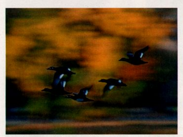
White-winged Scoter, a rare migrant in South Dakota, was detected once this season—this flock of five at Pierre 22 October 2005.