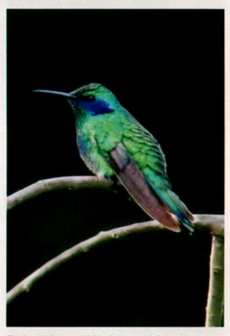
This Green Violet-ear at Highlands, Monmouth County, New Jersey 23 and (here) 24 August 2005 was not only a first for New Jersey but a first for the Atlantic seaboard as well.