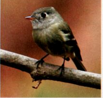
A second for Maryland but one of very few records for the East, this Hammond's Flycatcher was found along the North Central Railroad Trail, near Monkton, Baltimore County, Maryland 23 (here 28) November 2005 and superbly documented. It lingered through 2 December.

Virginia, this MacGillivray's Warbler was captured at Kiptopeke State Park, Northampton County, where 306,054 birds have been banded in over 517,000 net-hours since 1963.