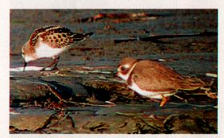
This juvenile Little Stint (left) at Boundary Bay furnished British Columbia's ninth 14 (here 21) September through 7 October 2005; the province's eighth record, an adult, came 5 September 2005 at the same location.