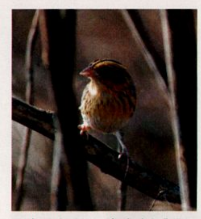
One of two Le Conte's Sparrows found at the Bradley Unit of Eufaula National Wildlife Refuge, Georgia in late (here 29) October through November 2005, this bird was uncharacteristically approachable.