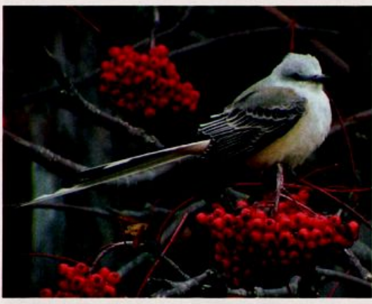
This Scissor-tailed Flycatcher was netted and banded during its stay at Thunder Cape Bird Observatory, Ontario 23-27 (here 22) October 2005.