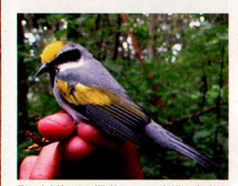
This male Golden-winged Warbler was captured 15 November 2005 at the bird monitoring station in Montecristo National Park. It was El Salvador's second fall record for the species, the first coming from the same park 27 October 2005.