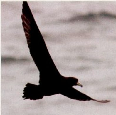
Figure 5. Parkinson's Petrel, showing feet projecting beyond the tail tip. Cordell Bank National Marine Sanctuary, Marin County, California; 1 October 2005.

even greenish tones) bill that show contrasting grayish black unguis (both the maxillary unguis and the mandibular unguis), culmen saddle, and sulcus (Marchant and Higgins 1990). White-chinned Petrel, about the same size as Westland (and therefore appreciably larger than Parkinson's), almost always has a pale unguis and almost always shows—at close range—white feathering at the base of the mandible (sometimes only in the interramal space), i.e., the "chin" (compare Figure