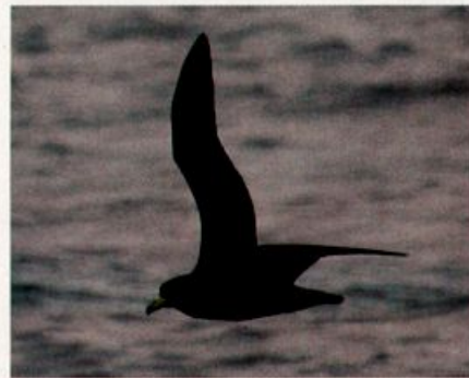
Figure 8. Parkinson's Petrel dorsal surface in flight. Cordell Bank National Marine Sanctuary, Marin County, California; 1 October 2005.