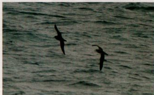
Figure 4. Parkinson's Petrel (left) and Pink-footed Shearwater in flight, showing their similar sizes. Cordell Bank National Marine Sanctuary, Marin County, California; 1 October 2005.