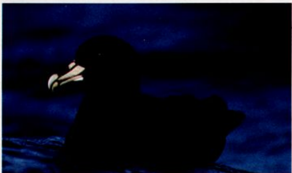
Figure 7. White-chinned Petrel, showing ivory-tipped bill and white chin. Kaikoura, New Zealand; 10 December 2004.

7). Some White-chinned Petrels do not show this feature (Falla 1937, Warham and Bell 1979, Warham 1996, Marchant and Higgins 1990), and so its absence clearly does not rule out White-chinned Petrel. Because size and proportions can be difficult to judge at sea, reports of any Procellaria in North America should be accompanied by notes on the bird's proportions in direct comparison to procellariids near it.