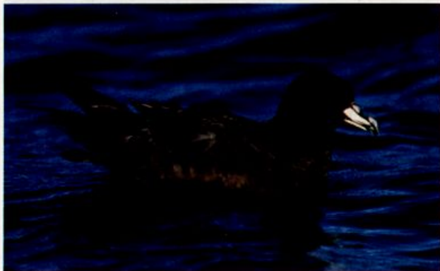
Figure 6. Westland Petrel, showing blockier head and larger, thicker bill than Parkinson's Petrel. Kaikoura, New Zealand; 10 December 2004.

even greenish tones) bill that show contrasting grayish black unguis (both the maxillary unguis and the mandibular unguis), culmen saddle, and sulcus (Marchant and Higgins 1990). White-chinned Petrel, about the same size as Westland (and therefore appreciably larger than Parkinson's), almost always has a pale unguis and almost always shows—at close range—white feathering at the base of the mandible (sometimes only in the interramal space), i.e., the "chin" (compare Figure