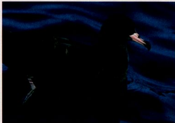
Figure 3. Flesh-footed Shearwater. Compared to Parkinson's Petrel, Flesh-footed Shearwater (as well as dark-morph Pink-footed Shearwater) has a thinner, longer, pink-based bill and pale pinkish feet. Hauraki Gulf, New Zealand; 6 December 2004.

son 1987, Marchant and Higgins 1990, Heather and Robinson 1997). The underside of the primaries may appear silvery gray in direct light (Marchant and Higgins 1990, Howell and Webb 1995; Figure 2). Flesh-footed Shearwater and dark-morph Pink-footed Shearwater by comparison are less bulky, have a longer, thinner, pink-based bill, a longer, less wedge-shaped tail, and pale, pinkish legs and feet (Figures 3, 4). Westland Petrel is a much larger bird than Parkinson's, often as much as 20% larger (Figure 6), and tends to look less slender in neck, body, and wings (Marchant and Higgins 1990). Although Parkinson's is comparable in morphometrics to Pink-footed Shearwater, it is an obviously bulkier bird to an experienced observer (Figure 4). In flight, Parkinson's often shows toes projecting beyond the tail; Westland shows little or no projection of the toes past the tail tip (Figures 2, 5). Compared to Parkinson's, Westland has a blockier (rather than rounded) head and a larger, thicker bill, features that can be hard to judge on a single bird at sea (Figure 6); the two species share a similar bill pattern, with most horn-yellowish (sometimes with bluish or