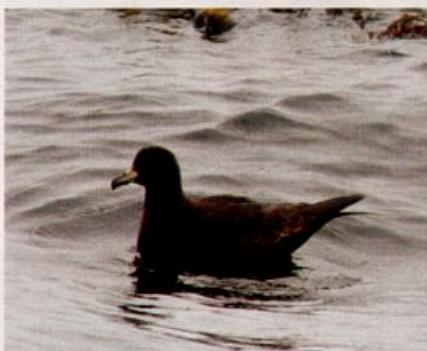
Figure 10. Parkinson's Petrel sitting on the water near Bull Kelp. Cordell Bank National Marine Sanctuary, Marin County, California; 1 October 2005.