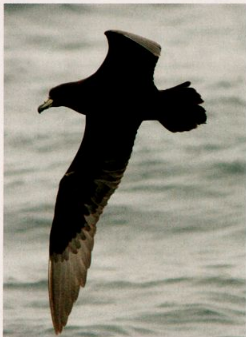
Figure 2. Parkinson's Petrel, Cordell Bank National Marine Sanctuary, Marin County, California, 1 October 2005. This image shows the color, structure, and pattern of the bill, silvery appearance of the remiges when seen from below, and the dark legs and feet.

(along with maintaining silence on the public address system) had permitted very close approach to seabirds on past trips. The location here was at 38° 05.788' N, 123° 22.281' W.