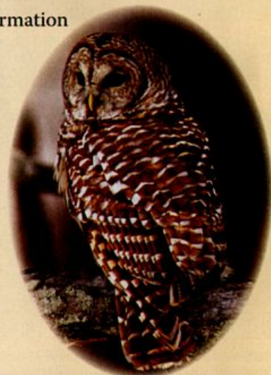
BARRED OWL BY GERRIT VAN

To subscribe, simply visit < http://bna.birds.cornell.edu > and use promotional code NAB06 or call our toll-free number, 1-877-873-2626.