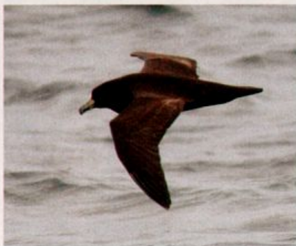
Figure 9. Parkinson's Petrel dorsal surface in flight. Cordell Bank National Marine Sanctuary, Marin County, California; 1 October 2005.