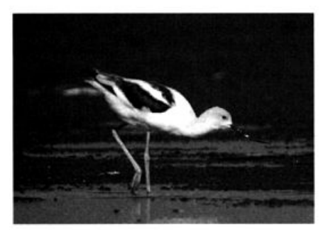
This American Avocet, spotted by Glynnis Nakai at Kealia Pond National Wildlife Refuge on 9 (here 12) September 2005, represents the first record of the species in the Hawaiian Islands.

jured bird was found in cen. Maui the next day (conceivably the same individual; *FD); and one was picked up on Kaua'i I. 11 Nov (SR). Up to 30 Cook's Petrels and up to 30 Stejneger's Petrels were observed e. of O'ahu I. 20 Sep (CM, ph. HS). These species can be difficult to separate at sea, but good photographs were obtained of both species. Ten Cook's were seen e. of Kaua'i I. 25 Sep (HS). A petrel turned in to Sea Life Park, O. in early Oct was photographed and released. Based on the photographs, the bird appears to be a Stejneger's, but even captive gadfly petrels are a challenge to identify.