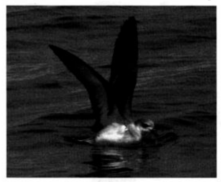
This Black-winged Petrel off Kaua'i, on 19 October 2005 clearly shows the diagnostic underwing pattern that gives the species its name.

Observers submitted only three reports of Hawaiian Petrels (Endangered), one between Kaua'i I and Ni'ihau I. 26 Aug (DK), 3 e. of O'ahu 1. 20 Sep (CM, HS), and 2 e. of Kaua'ı 1. 25 Sep (HS). Various gadfly petrels are believed to be regular migrants through Hawaiian waters, but we normally receive few reports, and some of these are of undetermined species. We had an unusually high number of reports of Black-winged Petrels this season one was photographed se. of Kaua'i 19 Oct (RB, GS); 2 were well e. of Kaua'i 25 Sep,