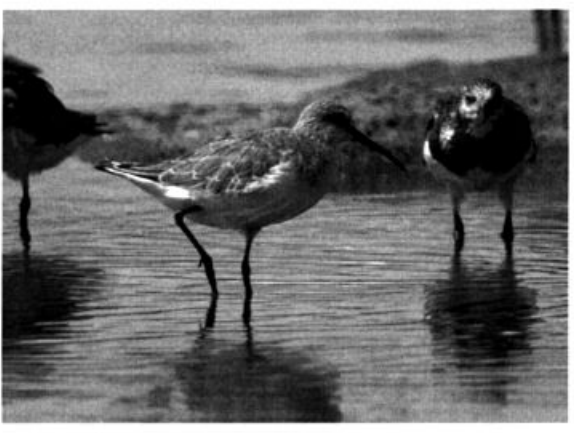
This rare Curlew Sandpiper was spotted at Pouhala Marsh in Waipahu on O'ahu Island on 16 October 2005.

Gulls were fairly scarce this fall. We received reports of one or 2 Laughing Gulls on O'ahu I. and Maui I. (m.ob.) and a single report of a Ring-billed Gull at Kealia 5 Oct