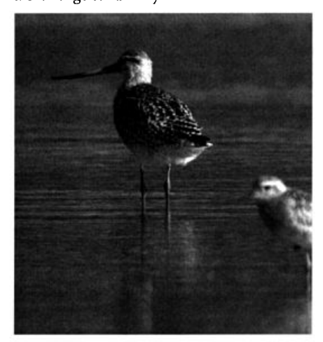
In autumn, most Bar-tailed Godwits are thought to migrate nonstop from Asia to the wintering areas, but a few drop in to the Hawaiian Islands en route. This juvenile was seen at Pouhala Marsh in Waipahu on O'ahu Island 15 October 2005.

jured bird was found in cen. Maui the next day (conceivably the same individual; *FD); and one was picked up on Kaua'i I. 11 Nov (SR). Up to 30 Cook's Petrels and up to 30 Stejneger's Petrels were observed e. of O'ahu I. 20 Sep (CM, ph. HS). These species can be difficult to separate at sea, but good photographs were obtained of both species. Ten Cook's were seen e. of Kaua'i I. 25 Sep (HS). A petrel turned in to Sea Life Park, O. in early Oct was photographed and released. Based on the photographs, the bird appears to be a Stejneger's, but even captive gadfly petrels are a challenge to identify.