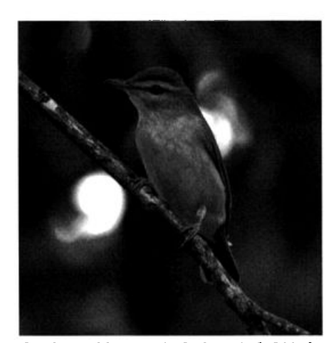
Providing good documentation for the species for Désirade Island, Guadeloupe is this image of a Red-eyed Vireo, taken 22 October 2005.

gle was seen. On 8 Nov, a Chimney Swift was present at Graeme Hall Swamp, Barbados for one of the few reports from the Lesser Antilles (SM, MF). A Ringed Kingfisher seen 30 Nov at Petit-Bourg, Guadeloupe (AL) furnished one of the few reports from that location.