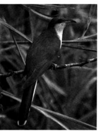
This Yellow-billed Cuckoo at Petite Terre Nature Reserve, Guadeloupe 24 November 2005 established a late date for the country.