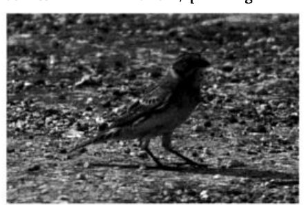
This Lapland Longspur at the base of Longbird Bridge, Bermuda was the only one reported on the island in autumn 2005.

Always rare in Bermuda, 3 Winter Wrens were discovered following Wilma: at St. Georges G.C. 26-28 Oct (PW); Port Royal G.C. 28 Oct (AD); and Ferry Pt. 4 Nov (PW). A Northern Wheatear on St. Georges G.C., Bermuda 27-28 Aug (PW) was an exceptional find, found some three weeks in advance of the earliest record; another was on Horn Rock, Bermuda 24 Oct (JM). A Wood Thrush was at The Retreat, Nassau 1 Nov (CW, RW). Seven Swainson's Thrushes were banded at Rock Sound, Eleuthera 21 Oct-28 Nov (K.W.T.R.P.), but the thrush of the season was a Bicknell's Thrush banded there 28 Oct, providing the 3rd Bahama record (ph. K.W.T.R.P.). A Swainson's Thrush remained at Désirade I. 21-23 Oct, providing a first