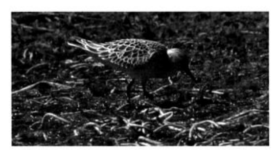
Eastern Washington's fifth Buff-breasted Sandpiper visited Reardan, Lincoln County 28 August 2005. Remarkably, three of the prior records of the species were from this location.