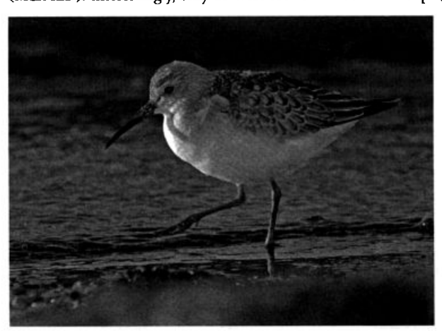
This juvenile Curlew Sandpiper was at Bottle Beach near Westport, Washington on 10 September 2005.