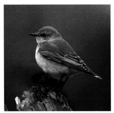
This Northern Wheatear in Parksville attracted much attention during its two-week stay (here 8 October 2005). The only previous Regional record was also from Vancouver Island—in 1970.

one was discovered at Rocky Point B.O. 22 Sep (JG, GD, GLM). Townsend's Warblers are lingering later and in greater numbers in recent years; this trend was particularly noticeable this year, with the species remaining rather widespread on Vancouver I. into late Nov (GLM). A Blackburnian Warbler furnished the