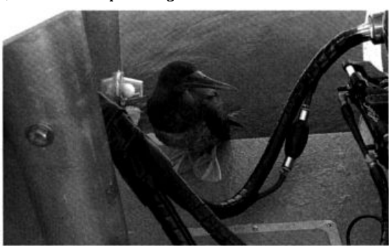
This Brown Booby, photographed near Salmon Bank, San Juan County 25 August 2005 furnished Washington's fifth record of the species and was the last of this summer's "invasion" that brought at least three into Oregon/Washington waters.

fulmar numbers were below average, with about 100 per trip. On the other hand, the CSCAPE trip encountered an estimated 3000 Black-footed Albatross and 45,000 Northern Fulmars near Heceta Bank 22 Oct. On 2 Nov, 77 Laysan and 38 Black-footeds were counted well off the Oregon coast (TS). The late Oct/early Nov CSCAPE cruises also uncovered a remarkable diversity of Pterodroma 267-313 km offshore from Tillamook Head to s. of Cape Meares. The Mottled Petrel total topped 20, adding to just 13 prior Oregon records (ph. RP, ph. L. Morse, TS). Three Cook's Petrels 20-22 Oct were Oregon's first (ph. PPy, RP); the only prior Regional record is of a beached bird in Washington 15 Dec 1995. Thirteen Murphy's Petrels were found 31 Oct-2 Nov (ph. RP, TS), adding to just three previous Oregon records (all dead and dying birds on beaches); these were particularly surprising, as most ne. Pacific records are from spring. Among the tubenose hordes near Heceta Bank, the Region's first and North America's 2nd Parkinson's Petrel was well observed and photographed 22 Oct (PPy, RP, JCa). Public pelagics tallied only 7 Fleshfooted Shearwaters; the Region averages about 20 per fall. Buller's Shearwater numbers were also low, averaging 30 per trip, while Sooty Shearwater numbers were extremely variable, from a goodly peak of 67,000 off Westport 20 Aug to a pitiful 150 or fewer per trip off Oregon. From shore, however, a stun-