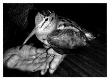
Literally a case of "what the cat dragged in," this American Woodcock was retrieved by a house cat 29 (here 30) November 2005 at Dillon, Montana. The bird was subsequently rehabilitated and released three days later. It represented the state's fifth record of the species.

Gyrfalcons in Montana 24 Oct-30 Nov represented an above-average fall total.