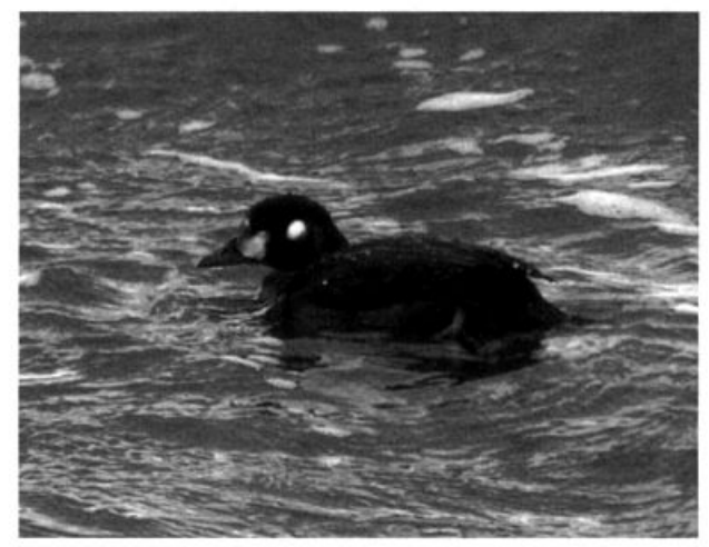
Furnishing about the seventeenth report for North Dakota, this Harlequin Duck was in Grand Forks 4 October 2005.

Sioux, ND (DNS). A Semipalmated Plover was late 29 Oct at Kelly's Slough N.W.R., ND (EEF), as was a Solitary Sandpiper 15 Oct in Grand Forks, ND (GL). The latest ever for North Dakota and the first for Nov, a Marbled