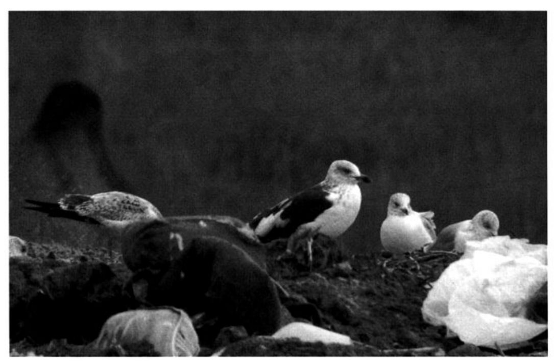
Up to eight Lesser Black-backed Gulls were reported in North Dakota in autumn 2005, including this leucistic bird at the Bismarck Landfill 29 October.

report for North Dakota. The bird was identified in the caption as a Ruby-throated Hummingbird (p.a., DNS).Phenomenal numbers of migrant hummers were reported from the Black Hills of South Dakota. In mid-Aug. hummingbirds were present at no fewer than 14 yards in Sturgis (RP). Most were Selasphorus hummingbirds. The 10th and 11th reports for Sough Dakota, Calliope Hummingbirds were in Lawrence 6-7 Aug (p.a., DGP) and in Pennington 14 Aug (p.a., RDO). A first for South Dakota, a Costa's Hummingbird was photographed near Nemo in Lawrence, SD 9-17 Sep (p.a., DGP, TJ, JSP). Numerous Broad-tailed Hummingbirds were also reported in the Black Hills.