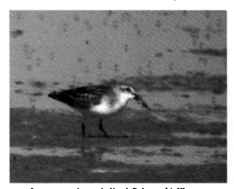
A very rare migrant in North Dakota, this Western Sandpiper in Dickinson 26 August was one of three reported in the southwestern corner of the state in autumn 2005.

Sioux, ND (DNS). A Semipalmated Plover was late 29 Oct at Kelly's Slough N.W.R., ND (EEF), as was a Solitary Sandpiper 15 Oct in Grand Forks, ND (GL). The latest ever for North Dakota and the first for Nov, a Marbled