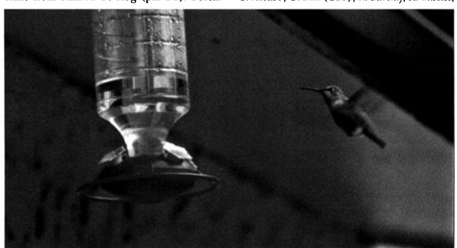
With only a handful of previous records of the species in Alberta, this immature Anna's Hummingbird, present at High River from late October through 18 (here 11) November 2005, was visited and documented by many birders.