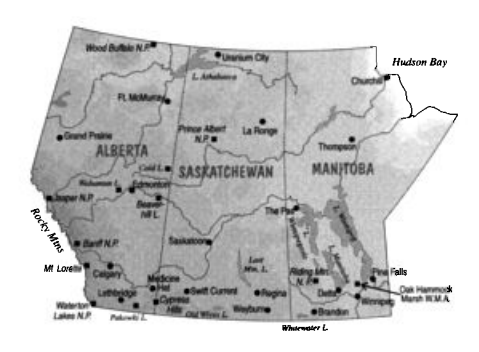
Rudolf F. Koes • Peter Taylor

fter an extremely wet summer, particularly in the southeast, dry and warm conditions prevailed over much of the Region until mid-November. The exception was central Manitoba, which experienced a return to heavy rains and attendant flooding in mid-September. Although the mountains of Alberta remained mild until the very end of November, the rest of the Region entered winter at mid-month, with very cold temperatures, and up to a meter of snow in southwestern Manitoba. Poor berry and cone crops, likely due to the wet growing season, resulted in a near-absence of winter finches. Large waders were prominent, especially in Manitoba, while best shorebird numbers came from Alberta. A Wood Stork, two alcids, an accommodating Anna's Hummingbird, and numerous lingering warblers provided some of the other highlights.