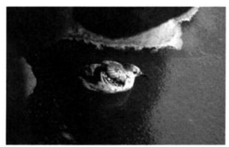
One of two extremely rare alcids in the Prairie Provinces region in autumn 2005, this Black Guillemot at Regina Beach 26-29 (here 26) November 2005 provided the second record of the species for Saskatchewan.

Only 3 Parasitic Jaegers were reported in Alberta 17-25 Sep (TH, IH, TK), and none were reported elsewhere inland. Although gull migration was generally described as poor in the south, there were several notable reports: Last Mountain attracted 25,000 Franklin's Gulls 9 Aug (GK); a Little Gull visited Tyrrell L., AB 9 Oct (D&TD); eight reports of Mew Gulls at Calgary 3 Sep-16 Nov involved 11 birds (RWo, MM, m.ob.); a second-year Lesser Black-backed Gull was at Gimli, MB 16 Sep (TK); and a Glaucouswinged Gull was seen at Lac La Biche, AB 13 Oct (RKI). Two Sabine's Gulls graced Redberry L., SK (SS, BW), while five reports came in from Calgary 4 Sep-26 Oct (m.ob.), and a