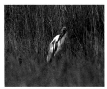
This juvenile Wood Stork was photographed at St. Ambroise, Manitoba on 5 August 2005. A first for the Prairie Provinces region, it was unfortunately not reported until several months later.

cana, AB 12 Aug (TK), 15,000 dowitchers at Reed L. SK 17 Sep (TK), 5000 Long-billed Dowitchers at Langdon Res. 30 Sep (RW), and 100+ Wilson's Snipe at a weedy, partially flooded field near Boissevain, MB 14 Sep (CC).