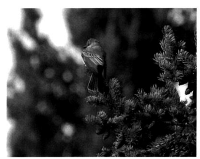
This apparent Tropical Kingbird was present on 29 October (here?) through 2 November 2005 at Au Train, Alger County, Michigan; the state has one prior report of a Tropical/Couch's Kingbird.