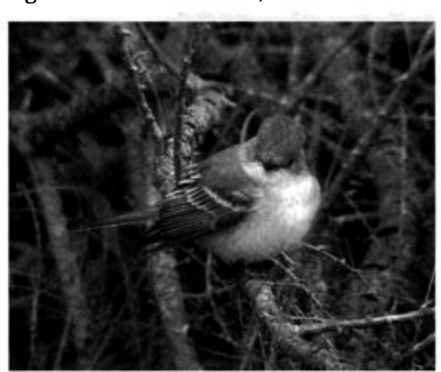
Photographed 22 October 2005 at Naubinway, Mackinac County, this Ash-throated Flycatcher made the fourth record for Michigan.