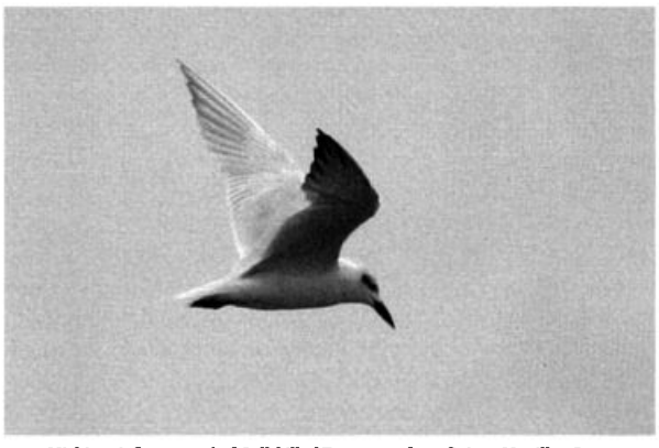
Michigan's first record of Gull-billed Tern came from Pointe Mouillee State Game Area, Wayne County (and adjacent Monroe County) 18 September 2005.