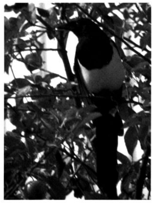
Two Black-billed Magpies spent 28 August through 14 (here 2) October 2005 in Damascus, Mahoning County, Ohio; it is uncertain whether these birds had been in captivity prior to their appearance there.

Evening Grosbeak appeared in Montgomery, PA 18 Nov (RK). The peak Red Crossbill count of 12 came at H.M.S. 20 Nov (LGo). Two early White-winged Crossbills were at H.M.S. 25 Aug (LGo).