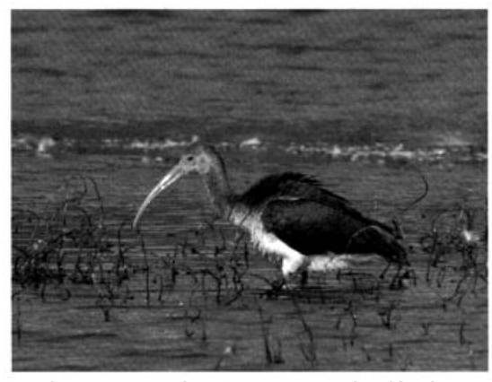
This immature White Ibis at Muscatatuck National Wildlife Refuge 12 November 2005 was the latest ever reported in Indiana.

this species in Indiana. The scoter migration through Illinois was above average, with double-digit counts for Surfs from three locations and a total of 60 individuals. Three Surf Scoters seen at Miller 23 Sep (DG, PBG et al.) furnished Indiana's 2nd earliest fall record ever. A peak count of 5 White-wingeds 25 Nov at Illinois Beach S.P. (AFS, DTW) was a highlight among the 20 reported for Illinois. Two Black Scoters 12 Nov at Carl. L. (DMK, KAM) were the farthest inland reported of the 18 seen in Illinois. Inland Indiana reports included only 2 White-winged and a single Black Scoter. Buffleheads peaked 14 Nov, with high counts of 83 at Chau. and 65 at Clinton L. (KAM). The lone lakefront Long-tailed Duck recorded was a female at Dunes S.P. 13 Nov (BIG et al.). Inland records of an early ad. male on L. Lemon 24 Oct (J&SH) and 2 females on L. Monroe 24 Nov (DRW) were the only others for the Region.