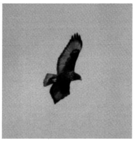
A rare subspecies so far east, this adult dark-morph Harlan's Hawk was found and photographed 13 November 2005 in Jackson County, Indiana.