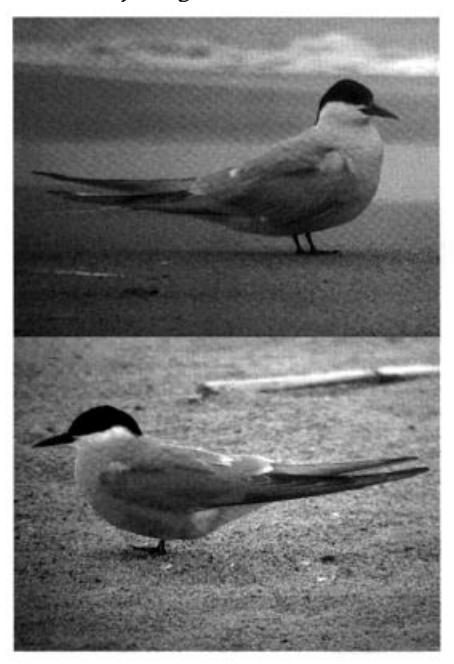
Two Arctic Terns were noted at Miller Beach, Lake County, Indiana just two days apart, 11 (below) and 13 (above) Au gust 2005. The species is a very rare migrant in the central Midwest.