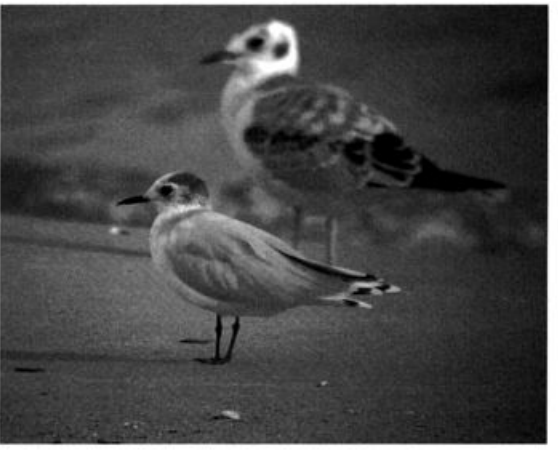
One of nine reported on the Indiana lakefront in autumn 2005, this Little Gull was at Miller Beach in Lake County 11 August.

m.ob.) provided the only Illinois record. An impressive and unprecedented 28 Sabine's Gulls flew past Miller in a single flock 16 Sep (DG)—one of the highest single-day counts ever for the entire Midwest (but see the Ontario and Western Great Lakes reports). The 3