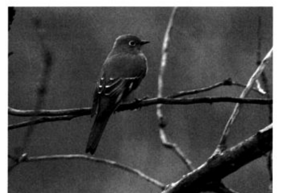
Two Townsend's Solitaires graced West Beach on the Indiana lakefront for more than a month this fall; this bird was photographed 6 November 2005 at West Beach, Indiana Dunes National Lakeshore.