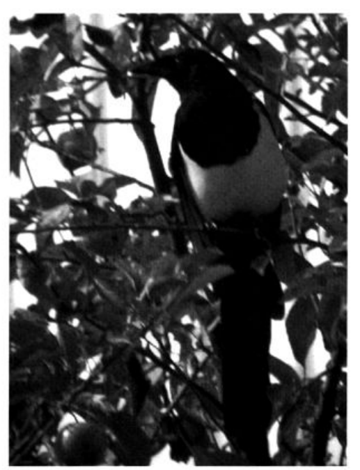
Two Black-billed Magpies spent 28 August through 14 (here 2) October 2005 in Damascus, Mahoning County, Ohio; it is uncertain whether these birds had been in captivity prior to their appearance there.

Evening Grosbeak appeared in Montgomery, PA 18 Nov (RK). The peak Red Crossbill count of 12 came at H.M.S. 20 Nov (LGo). Two early White-winged Crossbills were at H.M.S. 25 Aug (LGo).