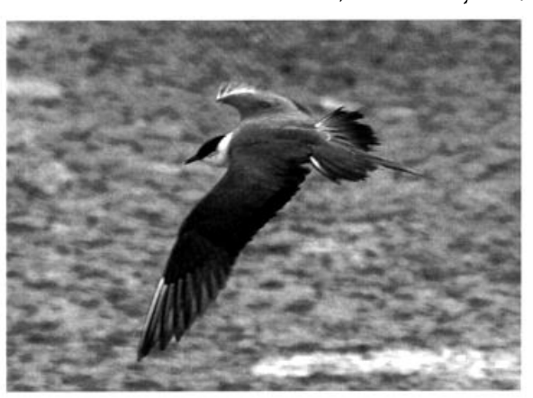
In Jefferson County, West Virginia, this adult Long-tailed Jaeger represented a first fully documented state record 24-26 (here 26) August 2005.