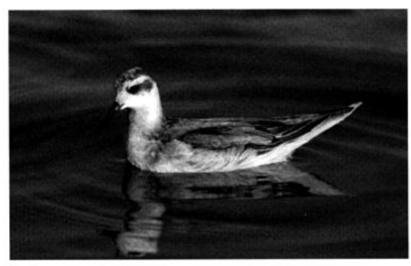
This Red Phalarope at Imperial Grasslands, Allegheny County, Pennsylvania 4-8 (here 6) September 2005 was a genuine rarity for the Appalachian portion of the state.

count of 1270 birds at Conneaut 31 Aug (VF, JP) was a consequence of Katrina, as was the state record 355 White-rumped Sandpipers (VF, JP) at the same location. This confluence of shorebird migration and tropical storm also brought down a season's worth of Baird's Sandpipers, 69, to the sand flats of Conneaut's harbor 31 Aug (VF, JP). Otherwise, a subpar three-dozen individuals were noted widely across the state. Up to 6 Baird's Sandpipers were seen at Y.C.S.P. during the fall (MH et al.), and 7 were at the S.R.C.F. 28 Aug (DH). Four Western Sandpipers at Y.C.S.P. 10 Sep (MH) and 5 in Somerset, PA 27 Aug (J&LP) were considered rare for sw. Pennsylvania, as were 4 in Cabell, WV 8 Sep (WA). A weak Ohio passage saw only 16 birds reported.