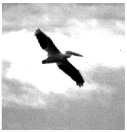
At the John Heinz National Wildlife Refuge in Philadelphia, Pennsylvania, this American White Pelican turned up briefly on 5 November 2005.