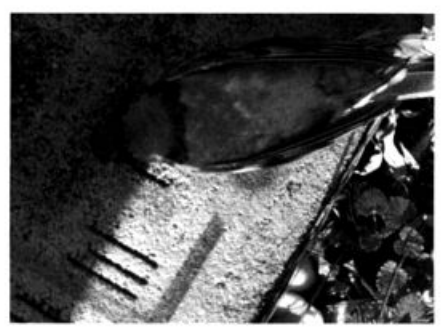
Providing a first specimen for the state was this male Varied Thrush at Glen Mills, Delaware County, Pennsylvania 19 November 2005.