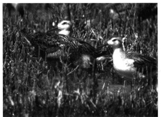
These Wilson's Phalaropes, with a Long-billed Dowitcher, were two of at least 16 raised at Port Susan Bay, Snohomish County, Washington (here July 30 2005). Wilson's Phalarope is one of a cadre of "interior" species expanding their ranges into western Oregon and Washington.