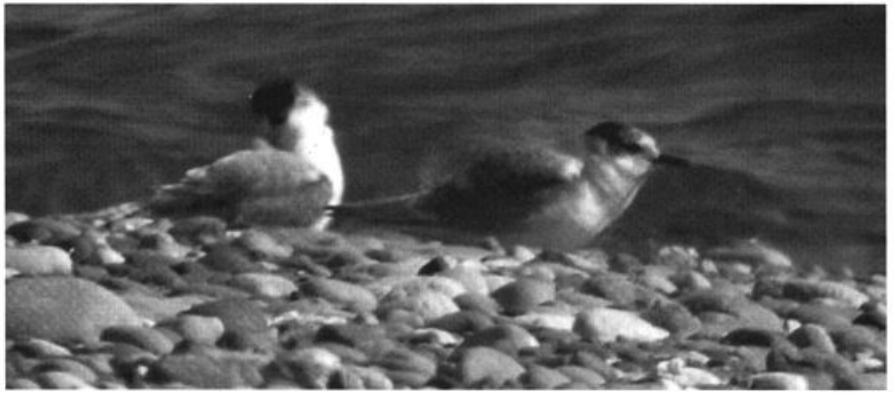
About 20 Arctic Terns were confirmed nesting on Dungeness Spit, Clallam County, Washington (here 24 July 2005); the species was also reported there last year. Prior to the discovery of this colony, the only Washington breeders had been in Everett, where the intermittent colony nested in an industrial area.