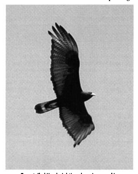
Zone-tailed Hawk sightings have increased in southern Nevada and southwestern Utah in recent years. This Zone-tailed Hawk was one of a pair attempting to nest near Laughlin in southern Clark County, Nevada.

expected range. Long-tailed Ducks made unexpected summer showings in Utah, with a female lingering on the Hurricane (SR-9) Sewage Ponds, Washington 4 Apr-20 Jul (RF) and another photographed at Black Rock 4 Jun (KW, PL, RF). A male Ruddy Duck with black head (a rather rare plumage