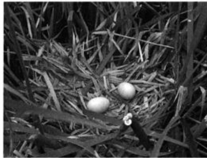
This White-faced Ibis nest at Rauscher Waterfowl Production Area, Filmore County furnished one of only a few confirmed breeding records for Nebraska.

records. Apparently rare in both states, but probably underdetected, were 3-4 Cave Swallows in Carter , OK 8 Jun (BF) and one in Morton , KS 22 Jun (SP). Two Red-breasted Nuthatches were in Omaha, NE in Jun (PSw), one possibly injured ( vide WRS ). A Carolina Wren singing in Red Willow , NE 21 Jul was w. of usual range (LR, RH). A late migrant of the w. Veery subspecies group salicicolus was in Scotts Bluff , NE 4 Jun (SJD, WRS). A late fallout of Swainson's Thrushes was detected 4 Jun in the Nebraska Panhandle, where 37 were counted (SJD, WRS). Single northbound Swainson's were in Garden , KS as late as 8 Jun (T&SS) and Chase , NE 11 Jun (MB). The only Sage Thrasher report was one in Sioux , NE 23-24 Jul (HKH). The Sioux , NE Curve-billed Thrasher, first