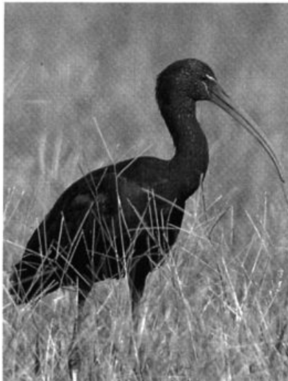
Uncommon on the Alabama coast in summer, this Glossy Ibis was well documented at Mobile 16 July 2005.