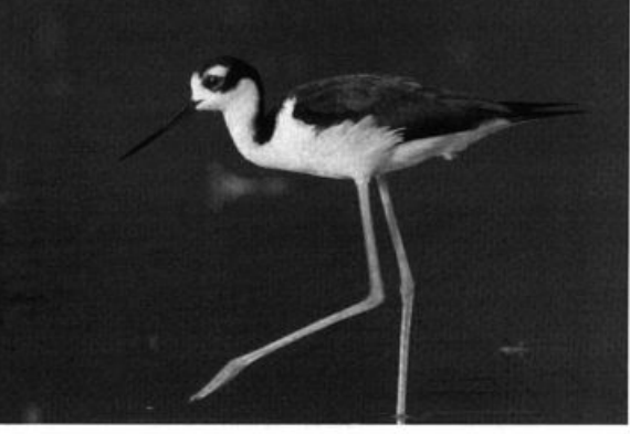
Only within the past five years has Black-necked Stilt been added to the list of birds known to have nested in Indiana. This bird (not a nester) was found 6 June 2005 near Columbus, Indiana and stayed through the following day.

M. 13 Jul (LS). Two Illinois reports consisted of singles seen 18 Jun (AFS) and 30 Jul (DFS) at Goose Lake Prairie S.P. The only reported evidence of nesting Virginia Rails included young birds seen 6 & 16 Jul at two different L. Cal. area locations (WJM) and 2 ads. with 2 young near Palos, Cook , IL (WSS). A total of 4 Soras was reported from