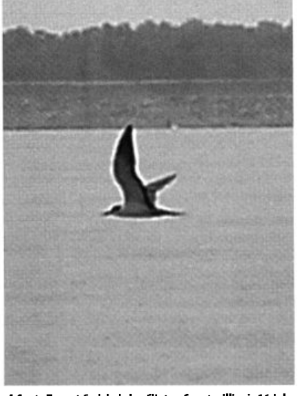
A Sooty Tern at Carlyle Lake, Clinton County, Illinois 16 July 2005 (here) remained through 25 July, a waif of Hurricane Dennis. This marks the third record of the species in Illinois.