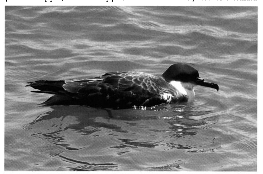
This Greater Shearwater at Avon, Dare County, North Carolina was photographed in the surfline 20 July 2005, clearly an ailing bird. Hundreds of this species turned up dead and dying along the East Coast in June and July 2005.

H.B.S.P. jetty 12 Jun (ST). There were only 2 Curlew Sandpipers reported this summer, with singles at Little St. Simons I., GA 12 Jul (BW, fide BN) and at the S.S.S. 17 Jul (SC). These reports, if accepted by the respective state B.R.C.s, would represent South Carolina's 3rd or 4th and Georgia's 5th. American Woodcock is a very localized uncommon