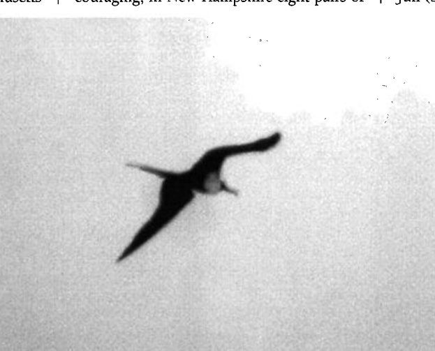
This Magnificent Frigatebird at South Beach, Chatham, Massachusetts stayed for only an hour 22 July 2005.