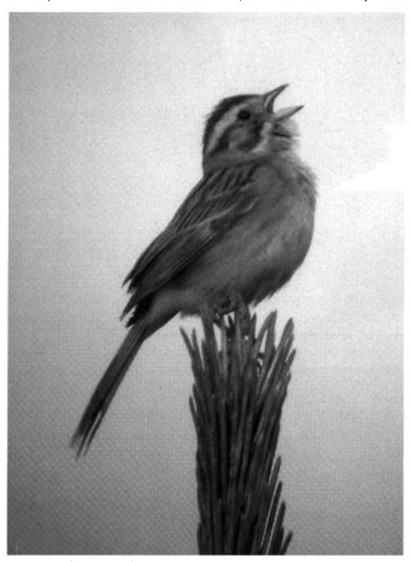
This apparently territorial Clay-colored Sparrow was found singing at Hedgehog Mountain Park, Freeport, Cumberland County 30 June 2005.

Pelecaniformes made a dazzling Regional showing this season. Heading the hit parade was a well-documented ad. Red-billed Tropicbird in the Gulf of Maine, first off Machias