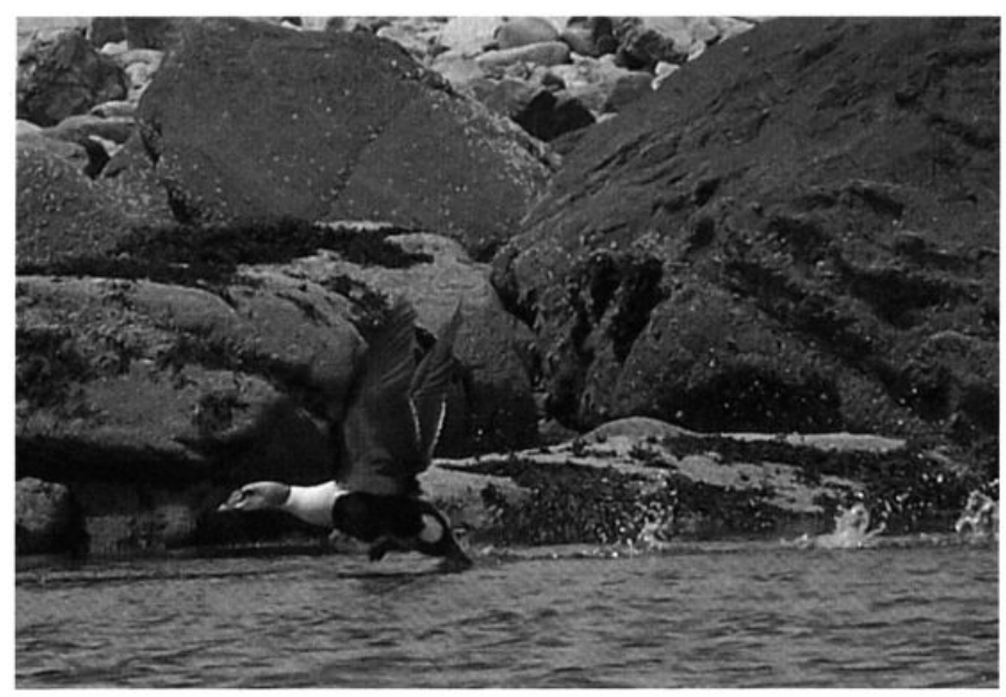
This male King Eider was found 3 June 2005 on an island off Woods Hole, Massachusetts, among a colony of nesting Common Eiders.

1528 Roseate Terns (stable), 6 Arctic Terns, 2647 Least Terns, and 5 Black Skimmers (C. Mostello, M.D.F.W., fide SM). Productivity was generally low this year, especially for Least Terns, a species that overall is not reproducing well, despite appearing to hold its own at the pair-count level (A. Jones, E. Jedrey, fide Mass Audubon Coastal Waterbird Program). At White I. and Seavey I., Isles of Shoals, NH, about 2500 pairs of Common Terns and 50 pairs of Roseate Terns nested