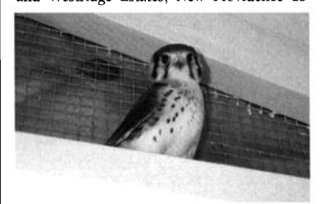
This immature male American Kestrel, rescued from a school yard at Freeport, Grand Bahama, confirmed that this species now nests on all the major islands in the Bahamas. The resident Bahamian birds are apparently a mix of sparveroides from Cuba and dominicensis from Hispaniola.

Abaco 30 Apr (BP, MG). Three were at Reef G.C., Grand Bahama 6 May (EG). A Snowy Plover was noted at Papayo salt flats, Lajas, Puerto Rico (MC), where nesting is likely. Snowy Plovers were nesting at Williams Town, Little Exuma 18 Apr (RS). This is near the n. limit of their range in the Bahamas. A pair of American Oystercatchers was noted 28 Mar at Desecheo I., Puerto Rico (MC). An American Avocet that wintered at H.W.P.N.P. was last seen 22 Mar (PD), On 25 & 29 Apr single Upland Sandpipers were at Lyford Cay G.C., New Providence (TWh, TH). A Eurasian Whimbrel reported last fall was still present at P.T.N.R. through 5 Apr (AL). Two Whimbrels flew past Crossing Rocks, Abaco 29 Apr (BP, MG). A Hudsonian Godwit was noted 1 Apr at Candelaria Lagoon, Cabo Rojo, Puerto Rico, one of few records of the species for that island (HL). Single Red Knots were seen on South Bimini 14 May (PD, TH, FS) and Westridge Estates, New Providence 15