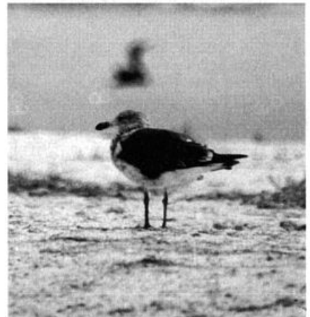
This immature Kelp Gull or Kelp-like hybrid was found at Las Coloradas, Yucatán on 2 March 2005.

Several Northern Parulas were observed Mar–May in the mangrove woods as far e. as Joaquín Amaro (JM). A male Chestnut-sided Warbler was at Cerro Huitepec 1 May (AM, JM). Single Yellow and Chestnut-sided Warblers were seen near T.V. 12 May. A male Blackpoll Warbler was in among a flock of warblers on an oak ridge between Limonar and Paval in the El Triunfo Biosphere Reserve, Chis. 27 Mar (BM). A Hermit Warbler near Yuvila 18 Apr furnished a new late date for the species in cen. Oax. A Blackburnian Warbler was apparently stunned by flying into a window at 3000 m (high) at Cuajimolyas 29 Apr. An American Redstart was recorded 10 & 12 Mar at S.A. Two Ovenbirds were recorded 7 Mar below El Estudiante (the village below La Cumbre). Three Northern Waterthrushes were seen 24 Mar w. of Tlacolula. A Mourning Warbler was seen 16 May at S.F.P. Both a fe-