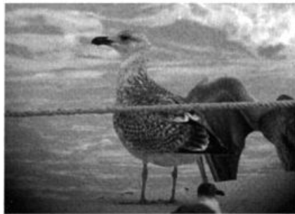
Close on the heels of the first record for Mexico, this first-winter Great Black-backed Gull showed up 1 March 2005 on the pier at Las Coloradas, Yucatán.

Two Yellow Warblers were still passing through Hacienda Chichén 4 May (IB, BG,