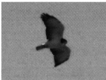
This adult light-morph Short-tailed Hawk was photographed 3 April 2005 in the Sierra de San Luis, Chihuahua, only 2 km from the United States border.

Abbreviations: La Cumbre (Sierra de Alo-