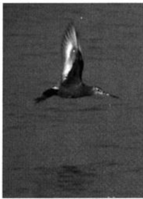
Another Chihuahua first discovered on a visit to Laguna Fierro 28 May 2005 was this Hudsonian Godwit in nearly full alternate plumage.

A Pileated Flycatcher was mist-netted in the Santo Domingo Botanical Garden in downtown Oaxaca City 24 Apr (ph. MG). Olive-sided Flycatchers were recorded 12 &