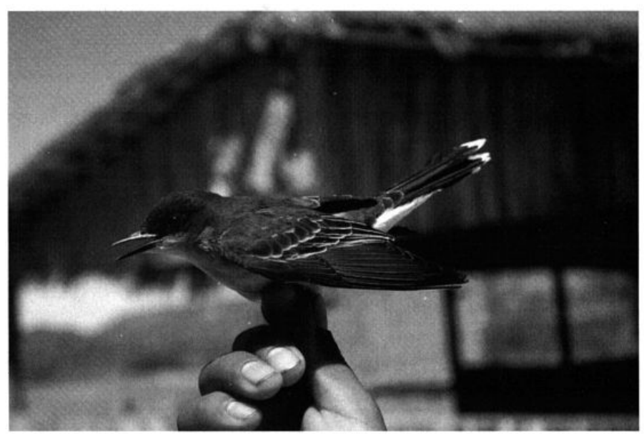
This Eastern Kingbird was at San Borja, Baja California 20 May 2005.

Gull-billed Terns provided much to comment on: 7 at El Centenario, BCS 22 Mar (DVP, MB, OJ) was the most ever reported there; 4 were foraging at Playas de Tijuana 3 & 17 Apr (MJB); up to 5 were at the Colonia Zaragoza sewage ponds 4–21