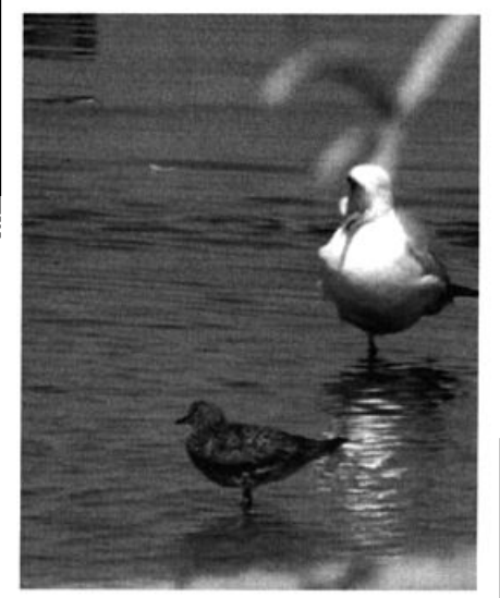
This Surfbird in alternate plumage was inland on the south shore of the Salton Sea near Obsidian Butte, Imperial County, California 19 March 2005.

Five wintering Pacific Golden-Plovers remained at Seal Beach, Orange through 23 Apr (DRW), and one near Imperial Beach, San Diego 6 Apr (RTP) was the latest of the 5 wintering there; 2 on San Miguel I. 1 May (DR) were probably migrants. An American Oystercatcher was at Prisoner's Harbor on Santa Cruz I. 16 Apr-14 May (BH). Solitary Sandpipers were scarcer than normal in the e. portion of the Region, but reports included 3 together near Chino, San Bernardino 8 Apr (DPel) and an exceptionally late one at Barstow, San Bernardino 29 May (HBK). Single Wandering Tattlers were inland at S.E.S.S. 1 (MJB) & 13 May (DPen). A Whimbrel at Owens L. 3 Apr (MJP) was one of only a few recorded in Invo. A Black Turnstone inland with wintering Ruddy Turnstones at S.E.S.S. 31 Mar-1 May (GMcC, MIB) was believed present all winter, but another at N.E.S.S. 22 May (DGo) was a migrant. An early migrant Surfbird at S.E.S.S. 19 Mar (HD) was inland, where very rare. A Red Knot near Lancaster, Los Angeles 19 May (MSanM) was the only one reported inland away from the Salton Sea. Two Sanderlings near Lancaster 19 May (MSanM) were also inland and away from the Salton Sea. The only Semipalmated Sandpipers were one at E.A.F.B. 7 May (JCW) and