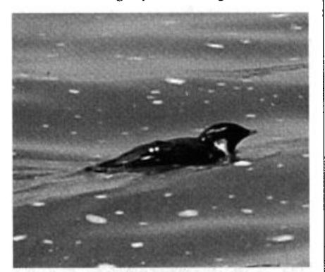
This Ancient Murrelet on the Salton Sea at Corvina Beach, Riverside County, California 29 May 2005 was only the third to be found on this inland body of water.

throated Vireo, casual in the Region, was on San Clemente I. 29 May (SWS). A Cassin's Vireo in Torrance 1 Jun (DM) was exceptionally late for a migrant. The latest reported date for several wintering Plumbeous Vireos was 17 Apr in El Segundo, Los Ange les (RB). Five Red-eyed Vireos 9 May–8 Jun were expected, but another in Irvine 30 Apr (BED) was exceptionally early. A Pinyon Jay near Thousand Palms, Riverside 11 Apr (CMcG) was slightly out of range and far out