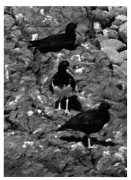
This American Oystercatcher frequented Prisoner's Harbor, Santa Cruz Island, California 16 (here 23) April through 14 May 2005. The irregular line separating the black breast from the white belly is typical for populations of the subspecies frazari found along the Pacific coast of Baja California; however, populations of frazari on the mainland coast of western Mexico tend to have a cleaner demarcation on the underparts.