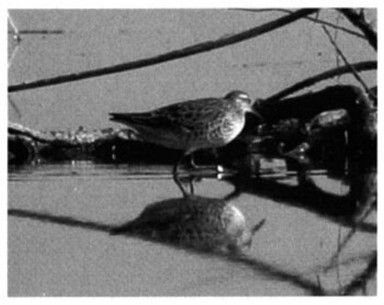
This adult Sharp-tailed Sandpiper in alternate plumage at the Whitewater River mouth at the north end of the Salton Sea, Riverside County 19 (here) through 22 May 2005 was only the third to be found in Southern California in spring.

singing Hutton's Vireo at Mid Hills Campground in the e. Mohave desert of San Bernardino (MR, BBr) was far out of range and likely of the interior stephensi subspecies (unrecorded in California but breeding as near as Mojave County, AZ). A Yellow-