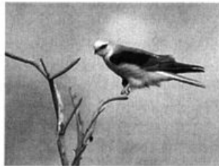
This White-tailed Kite, photographed 9 April 2005 in the Washington Fields, Washington County, Utah furnished the seventh documented record for the state and first in since 1992.