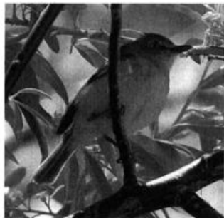
White-eyed Vireos are seldom encountered in the Great Basin and are particularly rare in spring. This one photographed 30 May 2005 along Sagehen Road in Dyer, Esmeralda County, Nevada was at one of the many little-visited (but often exceptionally productive) vagrant traps in the western reaches of that state.