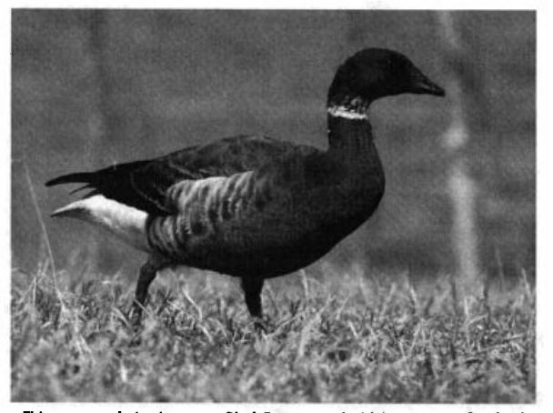
This accommodating immature Black Brant grazed with its surrogate family of Canada Geese among fishermen and picnickers at Cherry Creek Reservoir, Arapahoe County, Colorado 18 (here) and 19 March 2005.

A Snowy Plover visited Saratoga Lake 30 Apr-1 May (GB), possibly providing a first