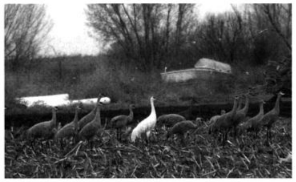
Alas, not all white cranes are Whooping Cranes! This bird caused a lot of excitement when seen at a distance in Prowers County, Colorado 14 March 2005, but closer observation proved it was a leucistic Sandhill Crane—still an interesting bird, laudably well documented.