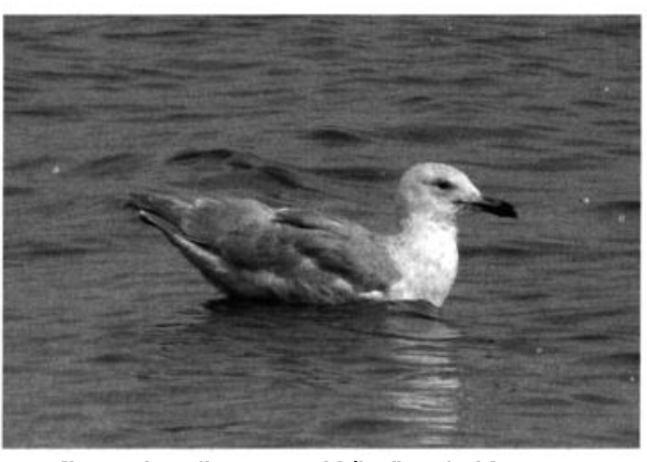
This second-year Glaucous-winged Gull at Cherry Creek Reservoir in Douglas County, Colorado on 14 March 2005 (here) later commuted to Marston Reservoir, Denver County, double-delighting county listers and larophiles alike.