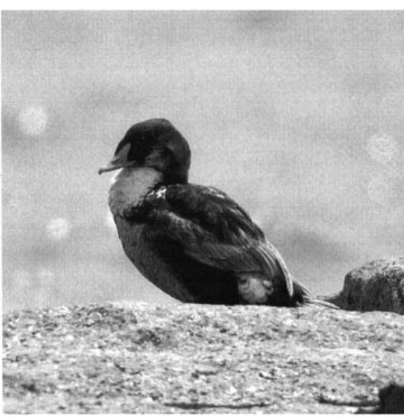
This immature male King Eider lingered at Bolivar Flats and East Beach, Galveston, Texas from 10 April through 9 May 2005 (here 17 April), providing the second state record.