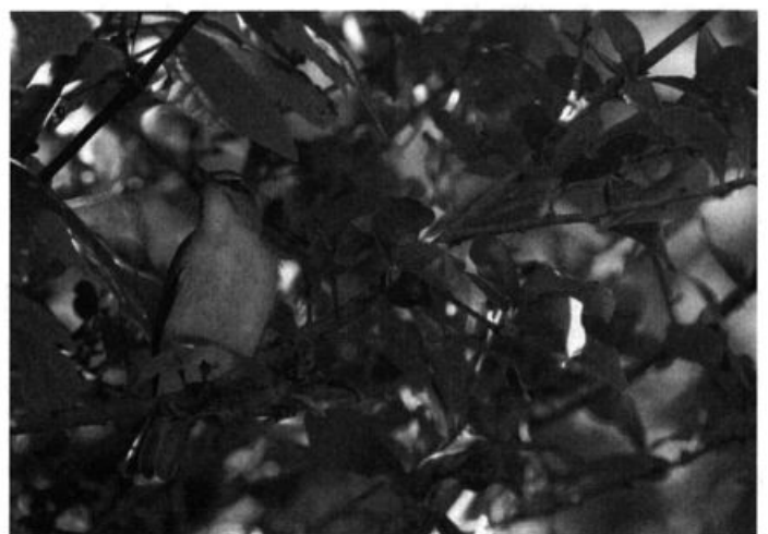
Black-whiskered Vireo has become an annual visitor to the Upper Texas Coast in recent years. In 2005, one remained at Sabine Woods, Jefferson County from 24 (here 28) April through 27 May, a remarkably long stay.

First found in Oct, the Downy Woodpecker at Ft. Bliss, El Paso was seen again 21–28 Apr (BZ, SB, LM). Pileated Woodpecker is considered rare in all seasons in n.-cen. Texas, so one seen in Grayson 21–25 Apr (WM) and another heard at the banding