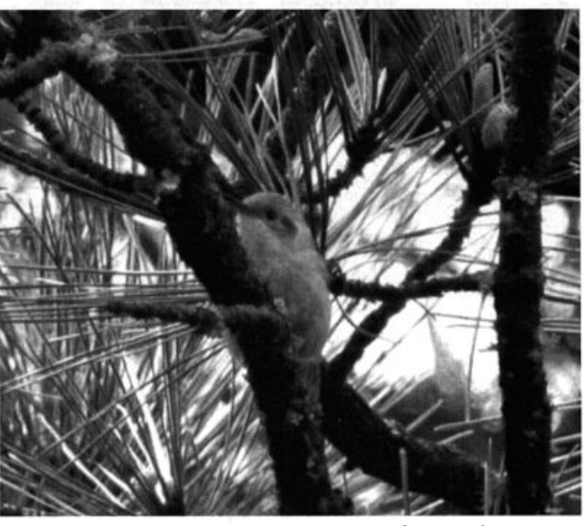
Another spectacular find from the central Davis Mountains of Texas was this immature male Olive Warbler discovered in Jeff Davis County 28 May 2005. It remained in the vicinity until 30 May (here), providing the seventh record for Texas.

†MR et al.), providing the 7th record for the state. Westward-wandering Golden-winged Warblers included singles at Junction, Kimble 12 May (RH) and El Paso 14 May (LW). Tennessee Warblers made an exceptional showing in the Panhandle and South Plains: 7 were found 16 Apr–14 May. A Tennessee Warbler on w. Galveston 1. 28 May (JSt) was very late. A Lucy's Warbler made a rare appearance in El Paso 2 May (BZ). A pair of Tropical Parulas at Hamilton Pool, Travis 11 May+ (SLo, RKa) was well away from known nesting areas. Continuing surveys in the mangroves surrounding the South Bay of the Laguna Madre have re-